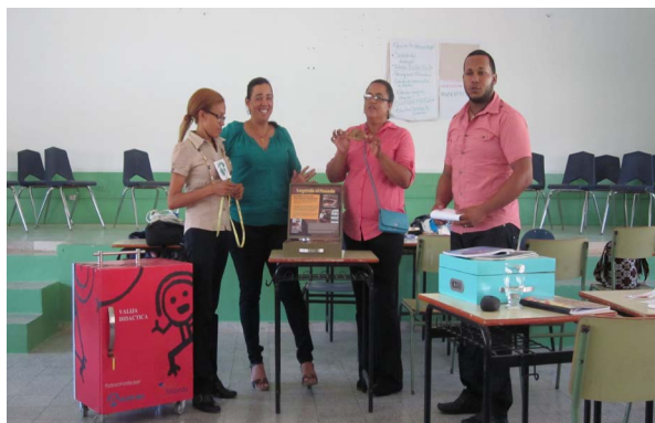
Figure 1. Primary school teachers participating in a workshop organized by Con Aguilar and Álvarez in the local school district of Monte Cristi, Dominican Republic, in 2015. The picture shows the teachers experiencing with the hands-on activities of “ La valija didáctica ” (“The didactic suitcase”) about the indigenous peoples of the Dominican Republic. This is an educational resource, offered by the Museo Arqueológico Regional Altos de Chavón.

The case study about Dominica shows that the connections between past and present are perceived differently here because of the presence of descendants of the indigenous inhabitants of the island in today’s society. Therefore, it raises questions of different dimensions about the curriculum of Social Studies.