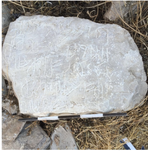
Figure 3: Photograph of the inscription