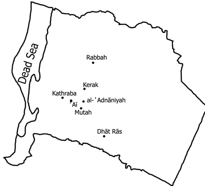
Figure 1: Map of the Karak Governorate showing the location of al-ʿAdnāniyah. Based on a map published by the Ministry of Municipal Affairs, Jordan ( http://www.moma.gov.jo/maps/karak.jpg ).

known texts from the Nabataean period in Moab. Moreover, other inscriptions were found at the site and those were dated to the Byzantine and Islamic periods (Canova 1954: 281–284).