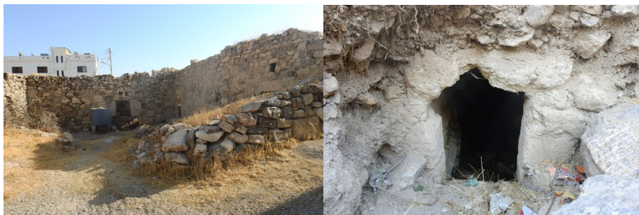
Figure 2: General view of the courtyard and the cave

Miller’s archaeological survey in the Moab Plateau yielded about 967 pottery sherds from al-ʿAdnāniyah. These were dated to the period between the Late Bronze Age and the Ottoman period, including sherds dated to the Nabataean period (Miller 1991: 113). These indicate that the site was continuously and densely inhabited during these periods.