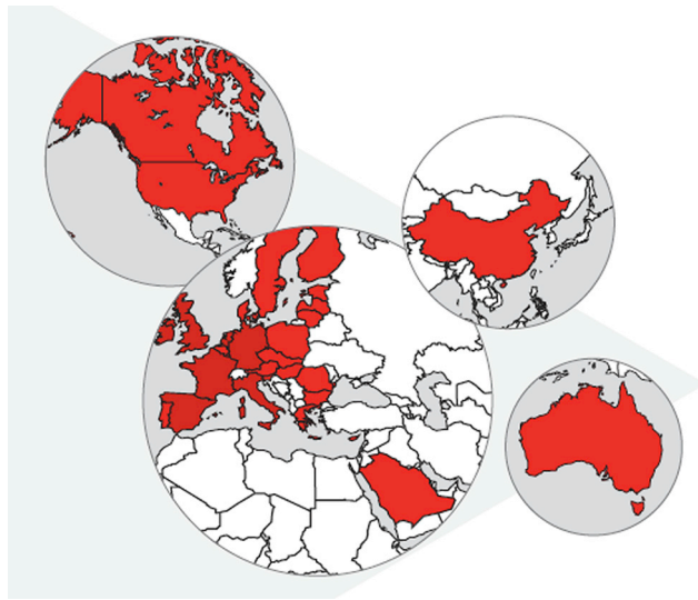
Figure 3. Map of the IRDiRC

The IRDiRC was formally launched in 2011 and currently includes member institutions from Asia, the Middle East, Australasia, Europe, and North America. The current cumulative commitment from the 42 member institutions from both the public and private sectors is estimated at more than $2,000,000,000 USD.