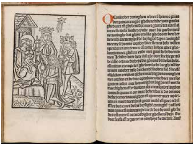
Fig. 9 The Adoration of the Magi and adjacent prayer text (fols. e6v–e7r), Devote ghetiden (fig. 1) (artwork in the public domain)

Each opening—each unit of text and image—allowed readers to engage in a meditation that fully combined text and image: as they moved their eyes back and forth between woodcut and prayer, the image served to deepen their meditative prayer based on the text. All prayers in the cycle on the history of salvation follow a similar structure: the votary addresses the Godhead or Christ in a way that is in keeping with the event, speaks words of gratitude, and then reads a brief description of the event, which is also shown by the image. The votary then moves on to make a request—always connected to the spiritual model provided by the description of the event. To study the function of these texts and the accompanying pictorial images as spiritual instruments in more detail, I will discuss three examples from different episodes of Christ’s life: the Adoration of the Magi (fig. 9), 50 the Crucifixion (fig. 10), 51 and the Supper at Emmaus (fig. 11). 52