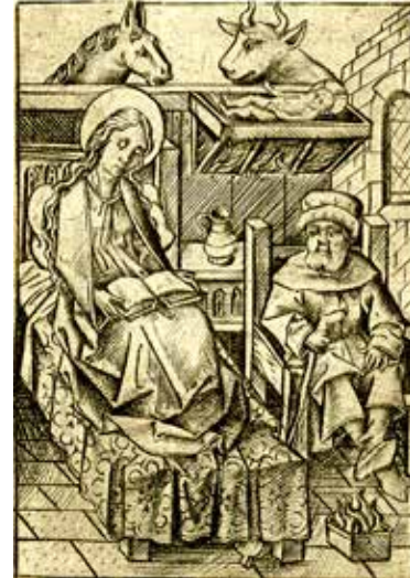
Fig. 12d The Nativity from Israhel van Meckenem, ca. 1460–1500, engraving, paper, 69 x 48mm, London, British Museum, inv. 1850,0223.6 (artwork in the public domain)

is stimulated. The perspective of the image, Christ and the disciples are seen from the back, as if the viewer were standing on the side of the road, invites the onlooker to join the group and walk with them to Emmaus. The main focus is now on Christ's lessons and the votary's plea that he/she might open his/her mouth only to speak of Christ's suffering. The actual supper is shown to the reader in the background of the image, clearly as an allusion to that earlier event. The strong sense of an evolving narrative within the image would have made the reader's meditative prayer less static. Guided by the text the votary is able to move through the dynamic of the continuous narrative in the image and experience the various stages of the prayer more fully.