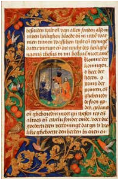
Fig. 20 Adoration of the Magi (fol. 42v), prayer book (see fig. 17) (artwork in the public