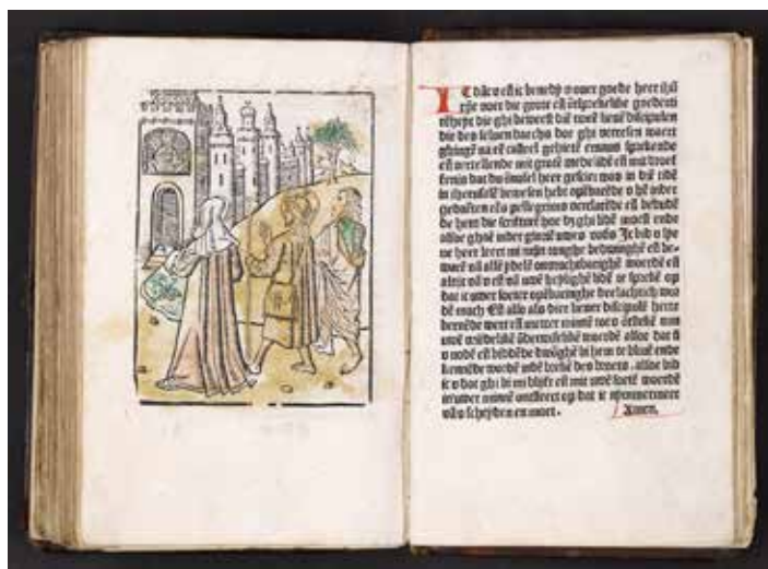
Fig. 13 Road to and Supper at Emmaus (fols. s1v–s2r), Devotieghetiden vanden leven ende passie Jhesu Christi (see fig. 12b) (artwork in the public domain)

is stimulated. The perspective of the image, Christ and the disciples are seen from the back, as if the viewer were standing on the side of the road, invites the onlooker to join the group and walk with them to Emmaus. The main focus is now on Christ's lessons and the votary's plea that he/she might open his/her mouth only to speak of Christ's suffering. The actual supper is shown to the reader in the background of the image, clearly as an allusion to that earlier event. The strong sense of an evolving narrative within the image would have made the reader's meditative prayer less static. Guided by the text the votary is able to move through the dynamic of the continuous narrative in the image and experience the various stages of the prayer more fully.