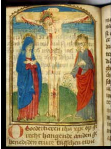
Fig. 16a The Crucifixion from (a) Master of Hugo Jansz van Woerden, prayer book (fol. 96v) (see fig 15) (artwork in the public domain)