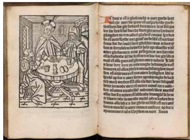
Fig. 11 The Supper at Emmaus and adjacent prayer text (fols. s1v–s2r), Devote ghetiden (fig. 1) (artwork in the public domain)

22 The first prayer addresses Christ as the “king of kings, lord of lords and prince of princes (O coninc der coninghen, o heer der heren, en o prins der princen)” and describes how his birth was revealed to the shepherds by an angel and to the three kings by a beautiful, miraculous star. 53 This event is turned into a model for the soul’s reformation as the votary prays to Christ through the “deep, wonderful humility (diepe, wonderlike oetmoedicheyt)” he has demonstrated and taught