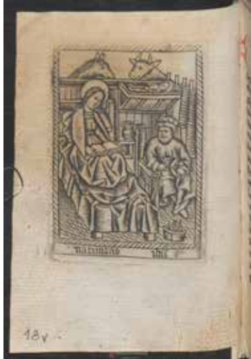
Fig. 12c1 The Nativity from Master of the Ten Thousand Martyrs, prayer book (fol. 17v), Dutch, after ca. 1485, paper, ca. 130 x 90 mm, Vienna, Österreichische Nationalbibliothek, Ms. Series Nova 12909 (artwork in the public domain)