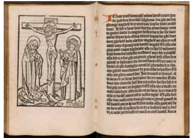
Fig. 10 The Crucifixion with Mary and Saint John and adjacent prayer text (fols. p3v–p4r), Devote ghetiden (fig. 1) (artwork in the public domain)