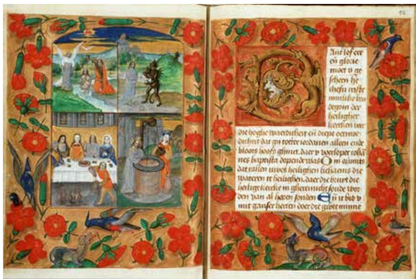
Fig. 18 Prayer book (fols. 51v–52r) (see fig. 17) (artwork in the public domain)

in which he chose either to show the most important event (as was the case with the Crucifixion on Saturday) or to combine several events in a single image, by dividing the miniature into several compartments (fig. 18) or, if the narrative sequence in the prayers allowed for such a treatment, by placing the events within a landscape, sometimes adding additional compartments in the border decoration and thus combining up to five “images” or episodes on one leaf (fig. 19). Images of subsequent prayers, which he was unable to fit onto the first leaf, were placed within or next to the initial at the start of the prayer, as was the case with the Adoration of the Magi (fig. 20). This layout is, of course, far removed from the image-and-text diptych in the printed books, creating an experience that was directed rather more toward the larger narrative. The size and layout of the images made them suitable as mnemonic devices and as meditative images that let the reader travel mentally through a number of events at a time—which is quite divergent from single devotional images functioning in close relation to the text of a prayer.