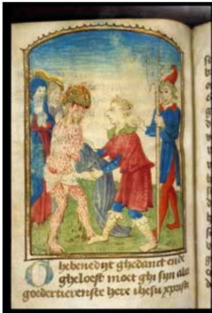
Fig. 15 Disrobing of Christ (fol. 85v), Master of Hugo Jansz van Woerden, prayer book, Dutch, ca. 1500, parchment, 131 x 90 mm. The Hague, Royal Library, Ms. BPH 79 (artwork in the public domain)

hand the prayers were apparently too long to fit on a single page. The prayers always start beneath the miniature and continue on the recto or verso page, depending on whether the miniature is placed on the verso or recto of a leaf. After the end of the prayer the page is left blank. This means that the reader was not able to move his eyes between text and image while reading the whole text of the prayer; or to connect aspects of the text to the image and let the image stimulate his meditation without having to leaf back. The images themselves, especially the ones that illustrate the Passion, evoke a meditation that is more focused on the bodily suffering of Christ: in the drawings Christ's body is covered with drops, streaks, and streams of bright red blood (fig. 15). 79