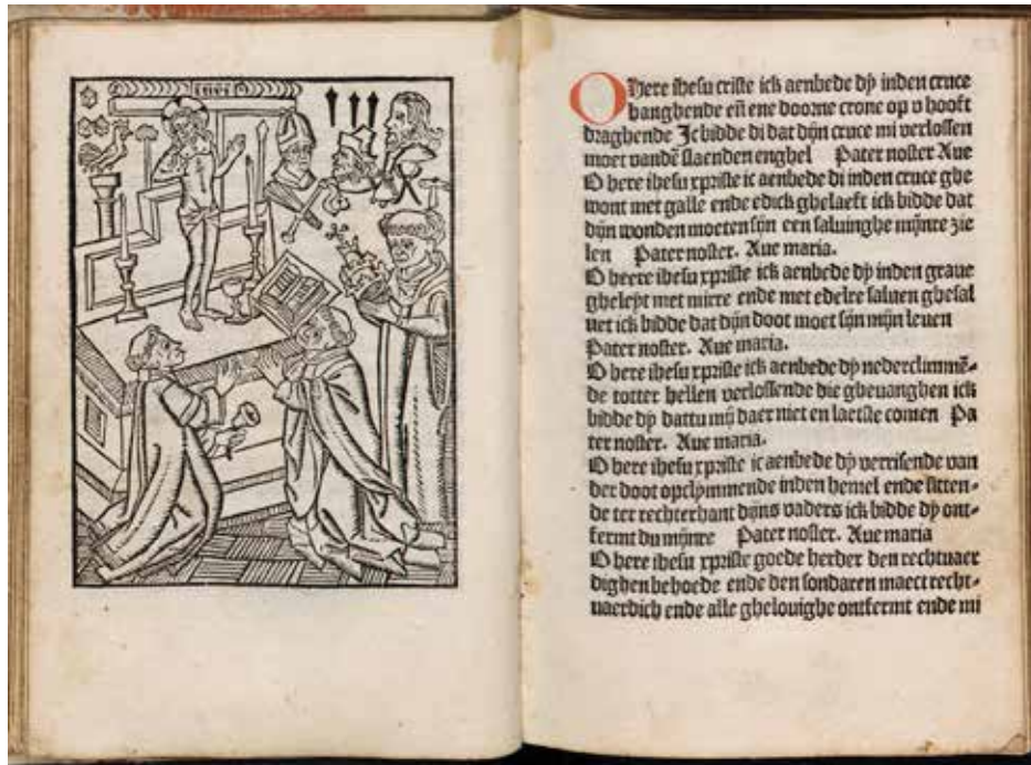
Fig. 4 Mass of Saint Gregory and Adoro Te prayer (fols. c6v–c7r), Devote ghetiden (fig. 1)