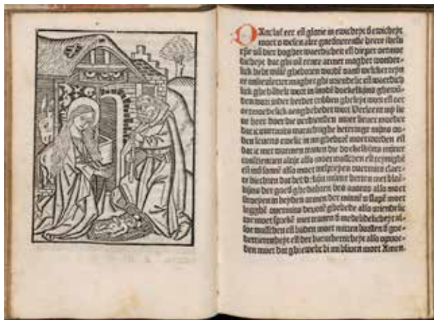
Fig. 12a The Nativity from Devote ghetiden (fols. e4v–e5r) (see fig. 1) (artwork in the public domain)

32 First, let us stay within the boundaries of printed book production. As mentioned above, copies exist of five printed editions of the Devote ghetiden and further editions (of which no copies have come down to us) are suggested by the existence of woodcut series that contain the full illustrational program of the text. The only edition of which a copy has survived that does not combine the text with Leeu's woodcuts is the 1486 Haarlem edition by Jacob Bellaert. 72 Even though Bellaert, a former apprentice of Leeu, borrowed printing material from his former master, for some reason he felt the need to have a new series of illustrations made for his edition of the Devote ghetiden . 73 Some of Bellaert's woodcuts differ considerably from Leeu's illustrations. This can be partially explained by the woodcutter's use of different models, as some compositions relate more closely to the Biblia Pauperum block book and engravings by the Master of the Ten Thousand Martyrs, as is for example the case with the Nativity scene (fig. 12). Some differences, however, do not have precedents in earlier illustration cycles and might have resulted from a close(r) reading of the text. In turn, this changed the reading and focus of the votary's meditative prayer.