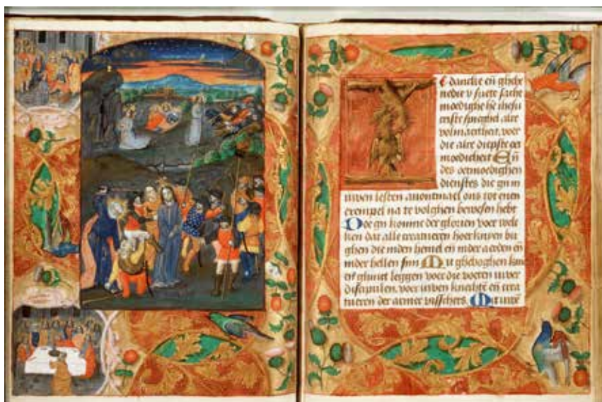
Fig. 19 Prayer book (fols. 62v–63r) (see fig. 17) (artwork in the public domain)