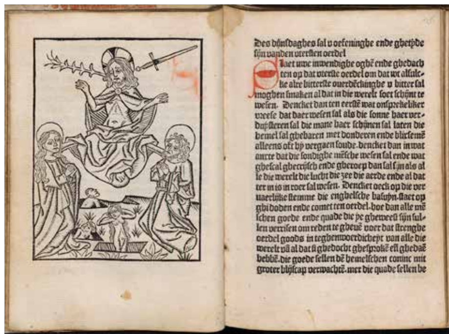
Fig. 3 Start of the chapter for Tuesday (fols. d1v–d2r), Devote ghetiden (fig. 1) (artwork in the public domain)

in the world taste bitter to you.” 33 The events that will take place during the Last Judgment are described in minute detail, with a strong focus on feelings, making the meditative exercise both visual and emotional. Through the description the reader “sees” and experiences everything—from the indescribable fear that will be caused by the eclipse of the sun and the heavenly signs of lightning and thunder, to the great timidity, shame, trouble, and disgrace of sinful people before the severe judge when the books containing all the thoughts, words, and deeds of every individual will be opened and read in the presence of the entire world. Everything that is now hidden from the eyes of men will be revealed and everyone will have to account for everything he or she has omitted to do and has done. The feeling of desperation all sinners shall experience is emphasized by a direct address to the reader, as if he/she were standing before the judge: “if you would want to deny something, you may do so, but God and the angels have seen everything, and especially your guardian angel will testify against you.” 34