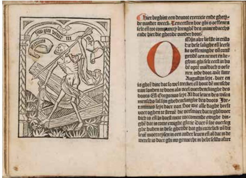
Fig. 2 Start of the chapter for Monday (fols. a7v–a8r), Devote ghetiden (fig. 1) (artwork in the public domain)