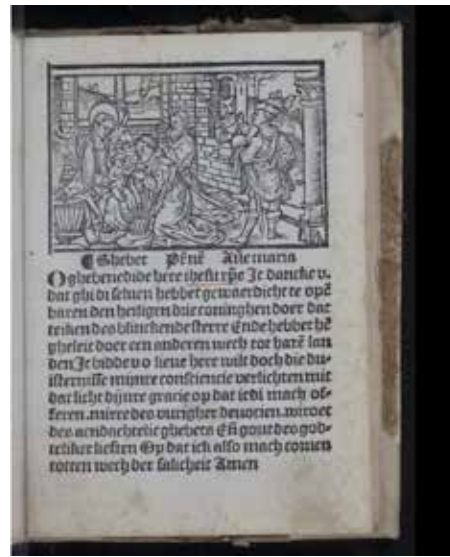
Fig. 8b Text and image (fol. 47r), Gerrit van der Goude, Dat boexken vander missen (Booklet on the Mass) (Gouda: Collaciebroeders, 1506), 8°. The Hague, Royal Library, Ms. 227

21 The Devote ghetiden and the prayer cycle in particular present an excellent example of how an unprecedentedly large amount of pictorial material could be integrated into the practice of prayer.