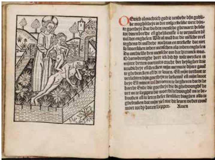
Fig. 7 Creation of Eve and the first prayer of the prayer cycle on the history of salvation (fols. b6v–b7r), Devote ghetiden (fig. 1) (artwork in the public domain)

into models the soul can emulate. All prayers are accompanied by a full-page image. Image and text face each other, evoking the sense of a succession of image-and-text diptychs (fig. 7). 47 A similar diptychlike arrangement of text and image can be found in other early printed books such as the Boexken vander missen (Booklet on the Mass) by the Franciscan Observant Gerrit van der Goude, where pictorial images and allegorical explanations of the acts during Mass are faced by meditative prayers and woodcuts depicting events from Christ's life (fig. 8a, fig. 8b). 48 The inclusion of images in such texts—one of the major advantages of the printing press that was commercially exploited by printers—altered not only the process of knowledge transmission but also devotional practice itself in that religious information was presented in an increasingly visual mode. 49