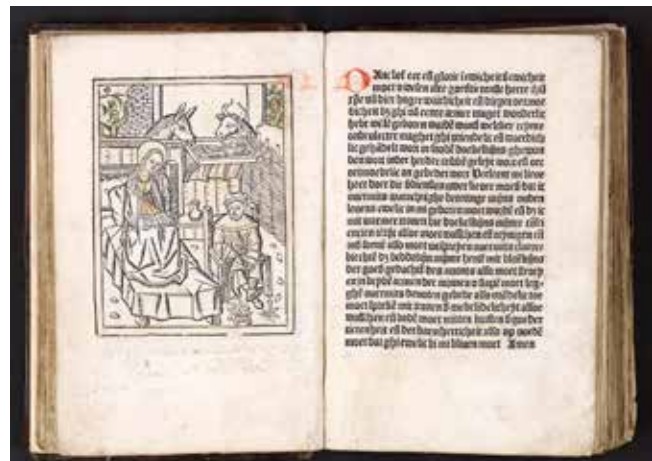
Fig. 12b The Nativity from Devote ghetiden vanden leven ende passie Jhesu Christi (fols. e4v–e5r) (Haarlem: Jacob Bellaert, April 8–August 20, 1486) 8 , Special Collections, University of Amsterdam, Inc. 421 (artwork in the public domain)

33 The woodcut next to the Supper at Emmaus prayer, for example, changes the reader's meditative experience considerably. The focus is not on the intimate scene of the disciples and Christ at the table (the tradition found in the work of Israhel van Meckenem and the Master of the Ten Thousand Martyrs). In Bellaert's woodcut (fig. 13) the actual meeting and the conversation between Christ and the disciples becomes the central event through which the reader's mental presence