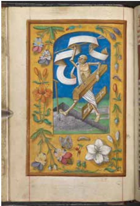
Fig. 14a Start of the chapter for Monday (fol. 6v), manual of prayers, Dutch, early 16th century, parchment, 190 x 120 mm. London, British Library, Add. Ms. 20729 (artwork in the public domain)

manuscripts offered more possibilities for customizing a text and tailoring a book to personal wishes. On the other hand, manuscript illumination not only had its own conventions, it was still relatively expensive and the inclusion of the same amount of visual material as was to be found in the printed editions of the Devote ghetiden , employing hand-painted miniatures on parchment, would have been very costly. This did occur, however, possibly when well-to-do laypeople of the upper echelons of society wished to integrate the exercises of the Devote ghetiden into their lives but preferred to do so by means of a lavishly decorated manuscript. An early sixteenth-century parchment manuscript at the British Library (Add. Ms. 20729), which has not previously been connected to the printed editions of the Devote ghetiden , contains the complete text illustrated with full-page miniatures and decorated with ornate borders (fig. 14). 74 In the prayer cycle on the history of salvation the manuscript follows the same image-text diptych layout as the printed versions of the Devote ghetiden . An inscription on the inside of the binding, “Gulleelmo de Dene,” might point to a lay owner, probably from Flanders. 75