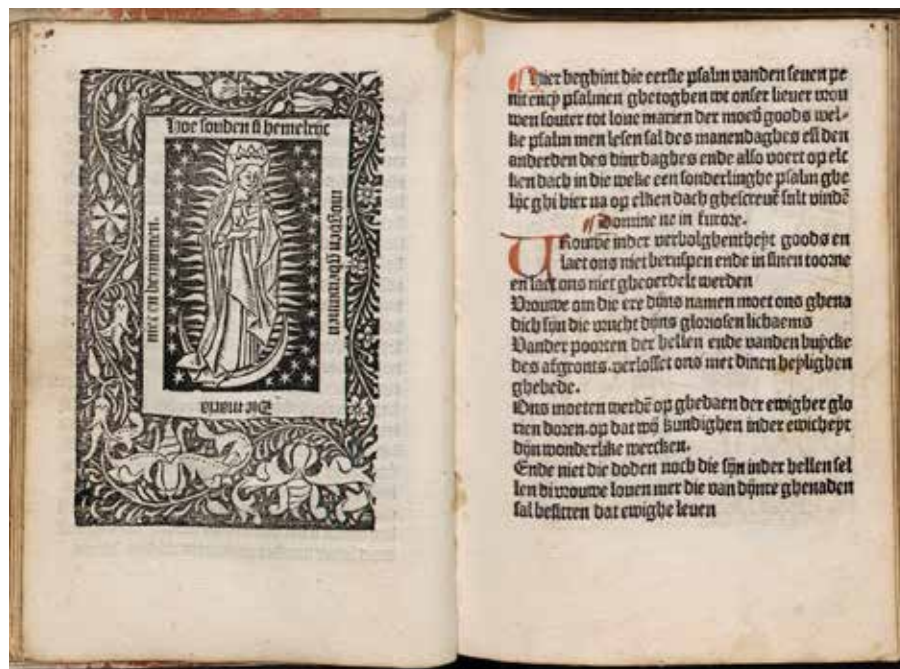
Fig. 6 Psalm from the Psalter of Our Lady ( Souter OLV ) (fols. c5v–c6r), Devote ghetiden (fig. 1) (artwork in the public domain)