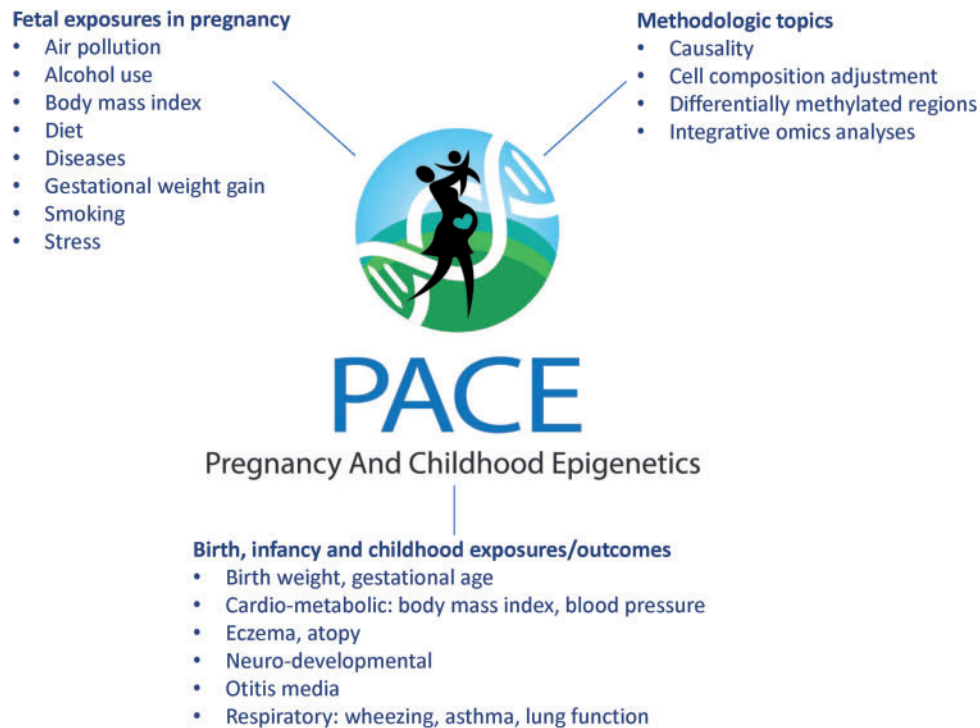
Figure 3. Current main exposures, outcomes and methodological topics in the PACE Consortium.

metabolomics if available, creating the possibility for integrative omics analyses. The availability of GWAS data enables analyses of associations of genetic variants with DNA methylation, as well as analyses to assess the potential influence of genetic variation on methylation variance, the possible causal role of DNA methylation differences using a two-step mendelian randomization approach, and adjustment for genetic markers of ancestry. 36–38