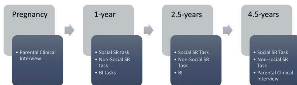
FIGURE 1 Time flow of the current study. Mothers and fathers of each participating child joined the lab visit at each measurement point. At 2.5 and 4.5 years measurement, there was also a home visit. SR = Social referencing; BI = behavioral inhibition.

At 2.5 years, BI was observed in eight observational tasks derived from the Lab-TAB (Goldsmith, Reilly, Lemery,