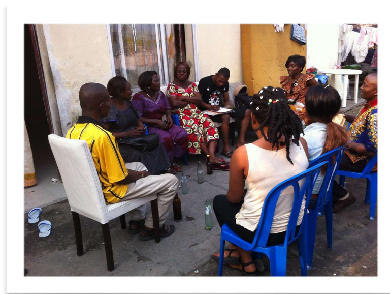
Picture 2: Focus Group held amongst a group of saleswomen ( vendeuse de feuilles de lianes), Kinshasa.

The Cameroonian team members are familiar with and to their fieldwork areas. Both are from the Bamenda Grassfields themselves, and both have concentrated their professional careers on subjects within the region. One of the researchers was involved in an earlier study (finalized in 2014) on mobile money, carried out with Langaa for the Institute for Money, Technology & Financial Inclusion (IMTFI). In addition, both researchers are familiar with doing ethnographic fieldwork, including gathering visual materials.