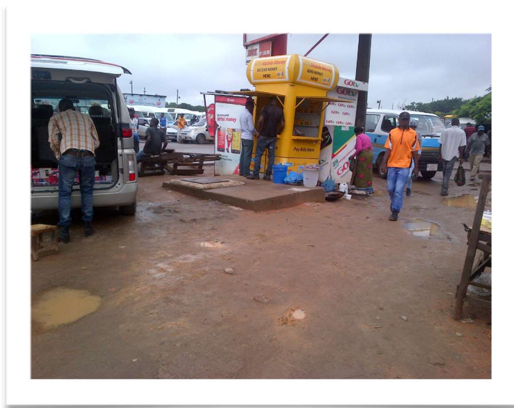
Picture 8: Airtel Money and MTN mobile money kiosks located at high traffic sites near Nkana East/Chambishi bus stations in Kitwe town centre. Edna Kabala

Mr Ngenda points at a scarcity of information about liability to bearers in case of a loss of money in unforeseen circumstances. In his case, the lack of guaranteed consumer protection fosters scepticism about the reliability of DFS. With the rapid expansion of the DFS industry in countries like Zambia, where the number of DFS providers increased from ten in 2008 to 28 in 2015, the industry's regulatory environment has not kept up sufficiently and is often not known to the consumers. 52