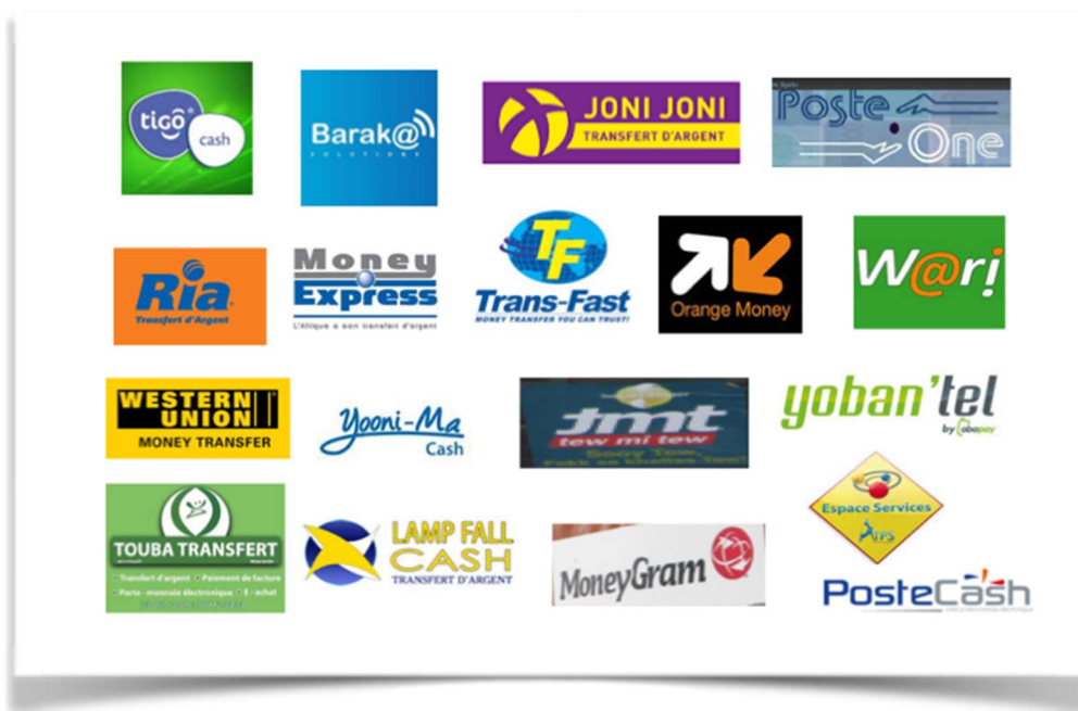
Fig 1: Advertisements for mobile money are ubiquitous in the African cities that we visited in recent months (advert compilation by the Dakar team).

Digital financial services have developed differently in Cameroon, Congo DRC, Senegal and Zambia. This differentiation in the development of DFS available is linked, to some extent, to the countries' communication infrastructures as well as the regulatory standards as formulated by the national states and supranational institutions. Together with the (potential) users of DFS, these services and the setting (infrastructure and regulation) in which they exist make up the mobile money ecosystem. This section of the report will give an overview of the "mobile money ecosystem" as the researchers encountered it, and as described to them by their informants. As the approach was to understand mobile money through the eyes of users and non-users, this report lets their voices and opinions precede the researchers' own "outsider" views. For a comprehensive (general) sector-informed overview of DFS ecosystems in the four countries, we refer you to the reports provided by UNCDF/MM4P and GSMA/Mobile Money for the unbanked. 21