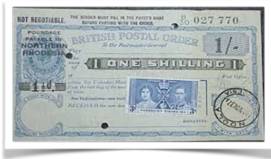
Picture 6: Postal order, Northern Rhodesia

Furthermore, there are banks that provide an instant, online or cardless option to their customers, such as Zanaco Xapit, FNB e-wallet and Barclays e-wallet. Zanaco in particular has a strong background in mobile money and has made significant investments in its successful Xapit programme that has been operational since 2008. Xapit has proved popular amongst farmers, traders, suppliers and the general public. Part of this popularity lies in the fact that internet access by mobile phone is not necessary, the software having been designed and tailored to also cater for low-income groups. Zanaco works in partnership with Airtel Zambia to provide Xapit. To further expand their outreach, Zanaco also uses the country's postal service, Zampost—reaching the unbanked population through their service known as Zanaxo Xpress.