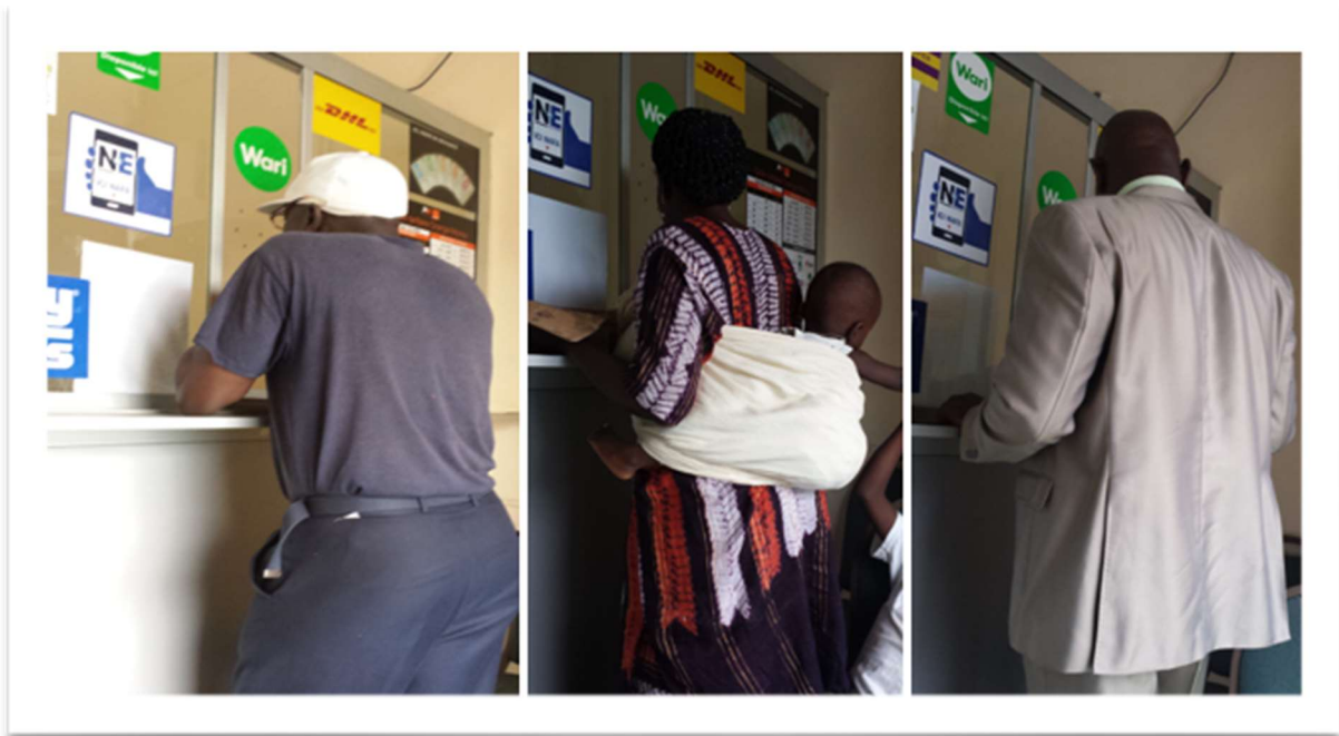
Picture 3: At the same mobile money agent and within 30 minutes of each other, different “user profiles” carry out a transaction, Pikine Savenelles. LARTES-IFAN.

The choice of these two cities can be explained by, among other things, the need to understand actors in a highly urbanized city (Dakar) and a relatively rural one (Louga). Money transfer services have developed rapidly in the informal sectors of Dakar's suburbs and in other areas with high emigration rates such as in Louga. The team focused on the influence of the informal economy and the effects of migration in the use of mobile money. They also concentrated on what mobile money was most used for, leading them to focus on (small) daily transactions. These types of transfers are vital, especially as regards everyday expenditure, and can inform clients' choice of products.