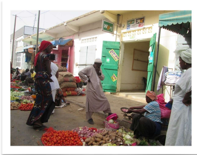
Picture 5: Money transfer services at close proximity to traders in a popular market in Louga.

Compared to the other countries, Senegal seems to be the most (technologically) developed in terms of the DFS on offer. It too has a history of migration and the sending of remittances that infiltrates the present-day mobile money ecosystem. Some of the older, traditional means of transferring money still function alongside the newer, digital means. Informants mentioned the continued use of hand-to-hand transfers, which has an especially long history in Louga. This type of transfer makes use of intermediaries who generally belong to the same social networks (family, village, known via-via). Sending money by road via transport services also continues today, especially in (remote) rural areas without electricity and where DFS service points are almost non-existent. Sending cash through money orders at the post office was a popular system before the advent of newer monetary transfer systems such as MTOs. It was particularly used for international transfers by migrants sending money home. There is also still a prominent role for tontines when it comes to financial dealings in general (especially savings and credit).