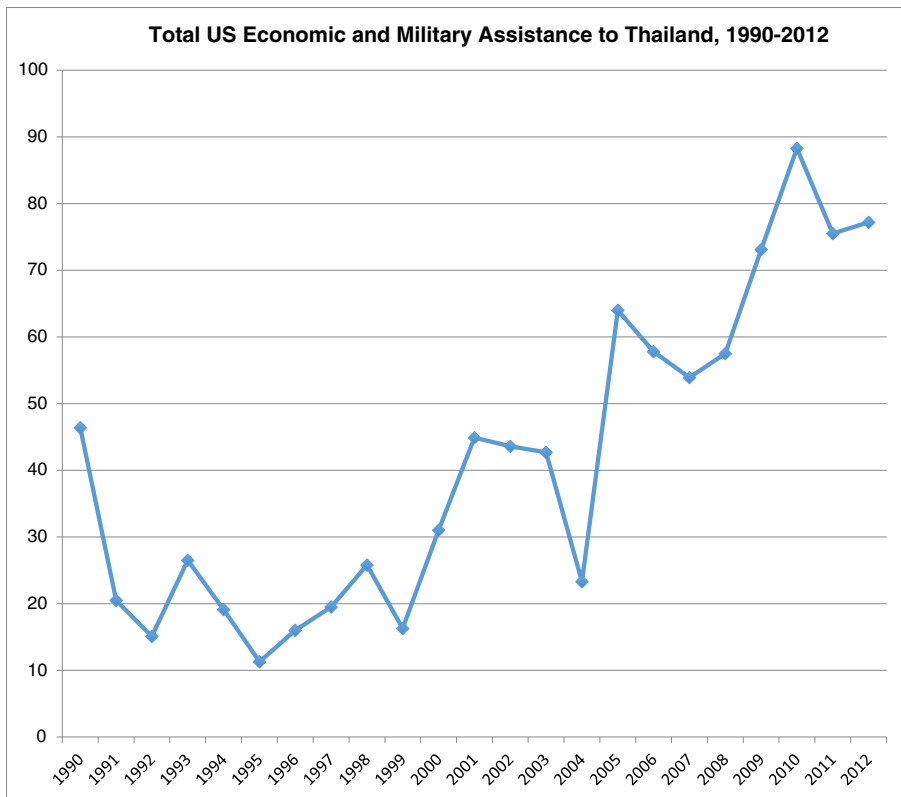
Fig. 2 Total US economic and military aid to Thailand, 1990–2012 (in millions USD).

that were crucial in increased state repression under the Thaksin regime. The American counterterror support for Thaksin's government is a case study that demonstrates how less powerful states still require external political support for regime consolidation. In periods of transnational security crises, the tactical counterterror alliance between powerful states and its dependent state allies could inadvertently undermine international human rights norms.