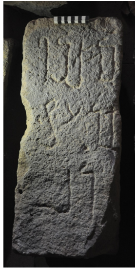
Figure 7: Photo of inscription 3