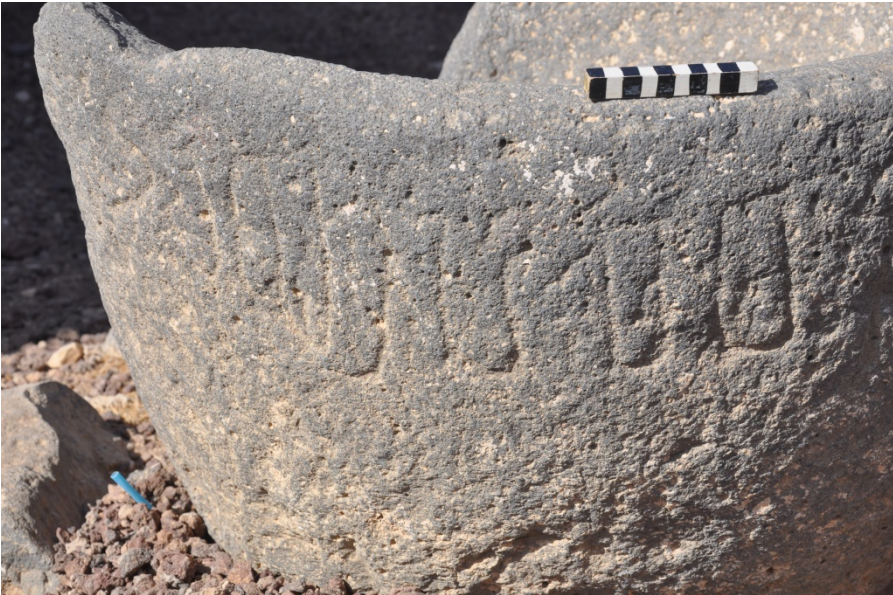
Figure 5: Photo of inscription 2