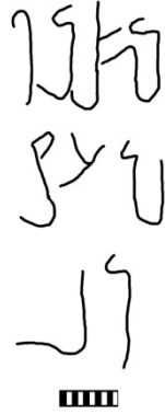
Figure 6: Drawing of inscription 3 (drawn by Zeyad al-Salameen)