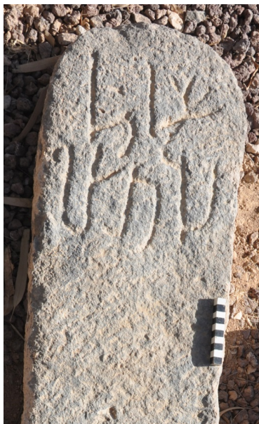
Figure 9: Photo of inscription 4