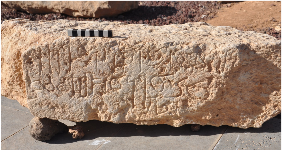
Figure 3: Photo of inscription 1