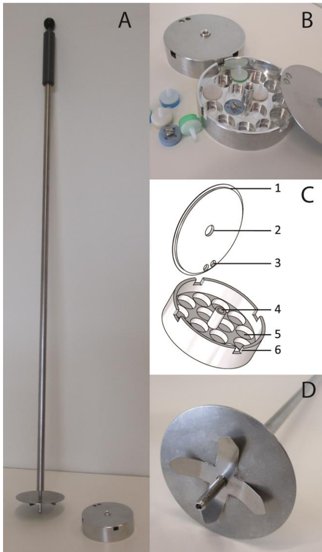
Figure 1. The cryo-storage system designed and developed for the preservation of cryo-EM samples

The cryo-storage system consists of pucks that are vertically stacked in dewar canisters and can be transferred with a retrieval-rod (A). The storage pucks are designed to hold 15 cryo-EM grid boxes (B). The pucks have separate lids with an engraved edge (C-1), two holes to manipulate the lid with tweezers (C-3) and a central hole to (C-2) to fit the central docking cylinder of the puck (C-4). Each puck has grid-boxes sized holders (C-5) and four notches at the edge to enable liquid nitrogen to flow into the puck (C-6). The retrieval-rod is optimized with leaf-springs and a self-locking pin (D).