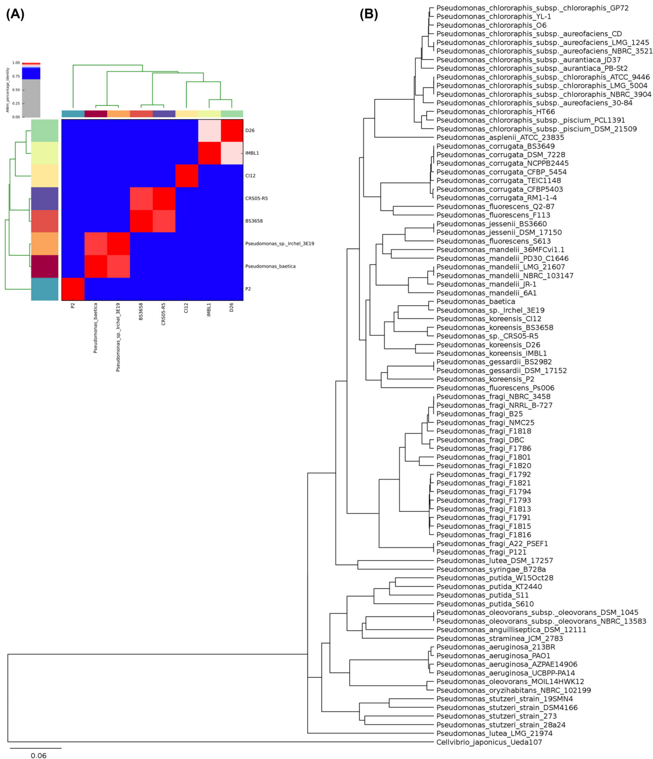
Figure 1. Placement of novel baetica genome in the genus Pseudomonas based upon ANI, and shared k-mers A) ANI heatmap generated the Python3 module pyani. The sequenced baetica genome, Pseudomonas .sp.Irchel_3E19 and reference genomes from the closely related koreensis subclade were subject to ANI analysis. B) A Mash-based tree generated from reference genomes ( n = 86 ) from 19 species clades, comprising the entire genus Pseudomonas . This tree was generated based upon the Jaccard index, calculated from shared k-mers. Cellvibrio japonicum Ueda107 was used as outgroup.