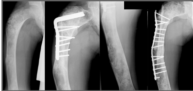
Fig. 2 The second patient who needed revision surgery (ID 12) was a male with a fracture through a fibrous dysplasia lesion of the proximal femur who was treated with a correction osteotomy and fixation with an angled blade plate in combination with an allogeneic strut graft at the age of fourteen (Fig. 2). He unfortunately sustained a stress fracture distal to the blade plate, 3 years after the initial surgery. The angled blade plate was removed during revision surgery and a long femoral plate was used to stabilize the femoral shaft. The patient was able to walk with crutches and had no more pain complaints. However, his severe coxa vara (FNSA 69°) remained unchanged