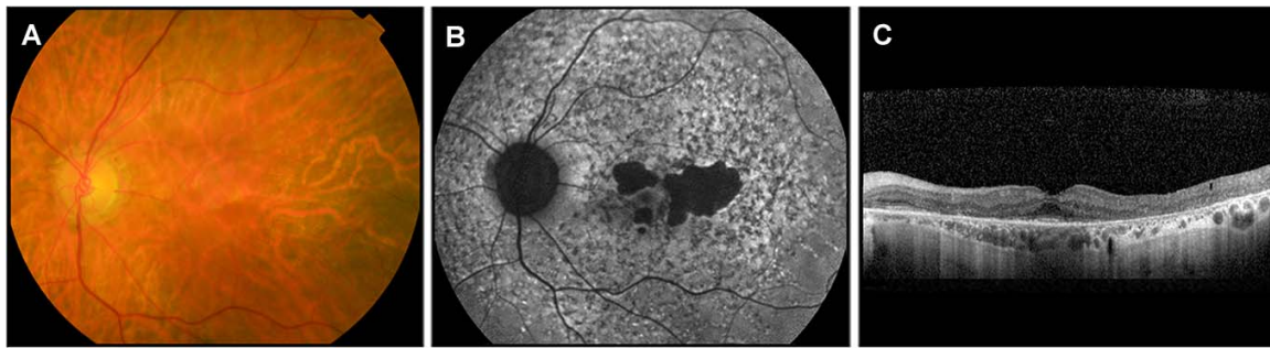
FIGURE 2. Retinal imaging of a patient with a very late onset of STGD1. (A) Fundus photography showed no signs of flecks in patient G-II:2 at the age of 72, 3 years after disease onset. (B, C) FAF performed in the same patient, at the same time, showed widespread hypo- and hyperautofluorescent lesions. FAF and OCT showed perifoveal chorioretinal atrophy with foveal sparing.

In 27/67 probands, we detected the single-variant allele p.As1868Ile; in 23 patients, we could establish the trans configuration of the identified variants (Figs. 1A, 1B; Supplementary Figs. S1, S2), either due to segregation analysis ( n = 21 ) or because the p.As1868Ile variant was found in a homozygous state (Y-II:1 and AA-II:1). In the remaining four probands (K-II:1, N-II:1, R-II:1, and Z-II:1), segregation analysis could not be completed due to the absence of DNA of relatives (Table, footnote #; Supplementary Fig. S2). Additionally, in probands I-II:3, J-II:2, Y-II:1, and AA-II:1, we could not exclude the presence of intronic variants in cis with p.As1868Ile, as the noncoding regions of ABCA4 in these individuals were not sequenced.