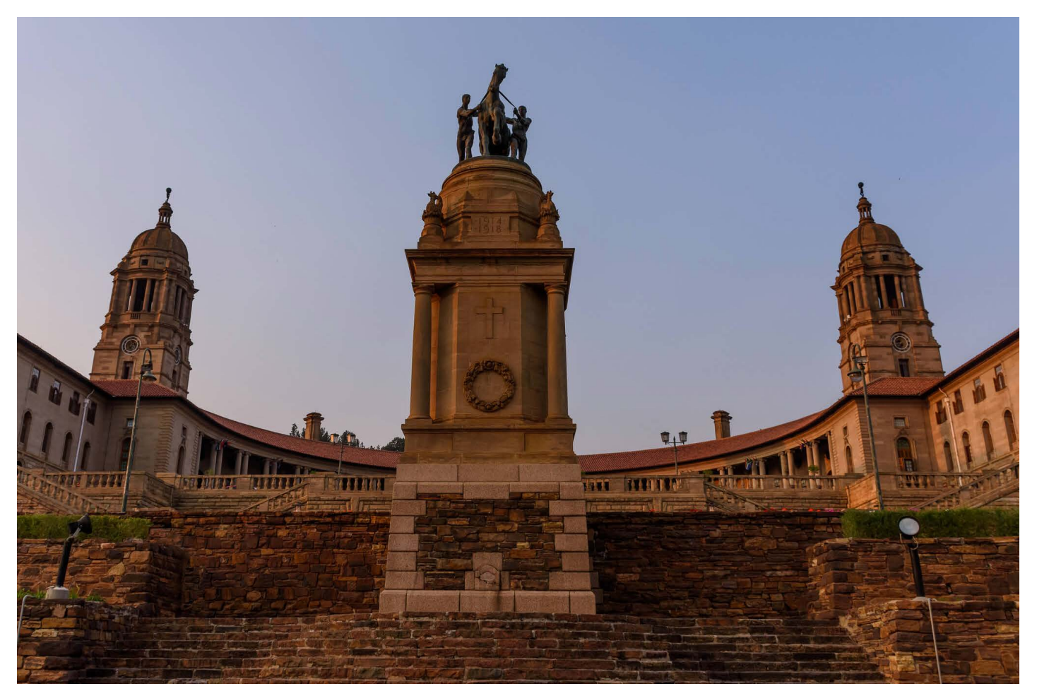
Union House Pretoria seat of Government

With regard to the various domestic issues that are at play in the individual BRICS countries, it is interesting to note that the domestic political agendas and the shared BRICS agenda seem to be treated in isolation from each other; domestic affairs and BRICS strategies do not seem aligned, and hardly mutually reinforcing. This may explain why there is 'international scepticism' about the prospects of BRICS as a major player in the global economy [30]. A more cynical take on this would be that the BRICS partners need each other as 'fellow emerging markets' in the global economic power play, but that they do not want any of their BRICs partners to be witnesses to the manner in which they deal with domestic challenges, At least that is how BRICS is treated in South Africa's foreign strategy.