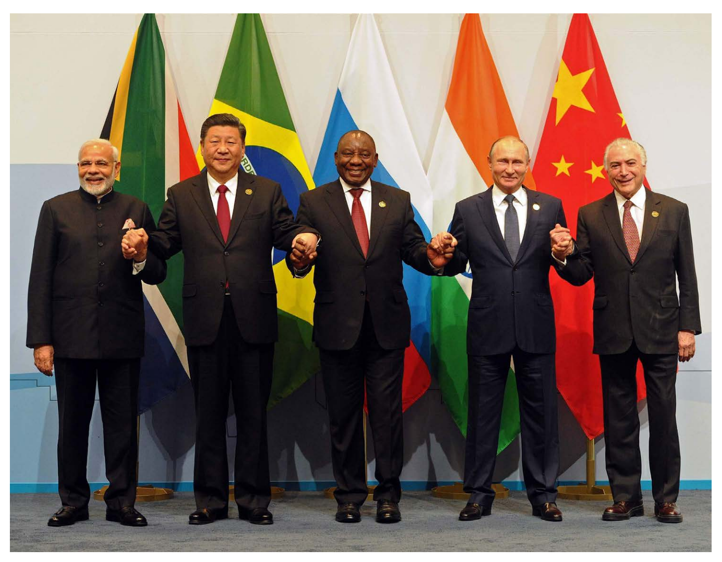
BRICS leader's family photo in South Africa, 2018 at the 10th BRICS summit.

Zuma presidency <sup>[19]</sup>; in Russia the links between state and parastatal enterprises, and informal super-mafia tycoons is similarly shrouded in mystery under Vladimir Putin <sup>[20]</sup>. The Chinese leaders, most recently China's 'new emperor' Xi Jinping who presented Putin with China's 'Friendship Medal' in June 2018, hold a firm grip on the economy. A similar tendency is seen in India, now under prime minister Narendra Modi <sup>[21]</sup> and Hindu-nationalist president Ram Nath Kovind. <sup>[22]</sup> Finally, Brazil, with the recently elected populist Jair Bolsonaro <sup>[23]</sup>, has a very closed and nationally oriented economy that is likely to be neo-liberally restructured by banker and Minister of Finance Paolo Guedes. <sup>[24]</sup>