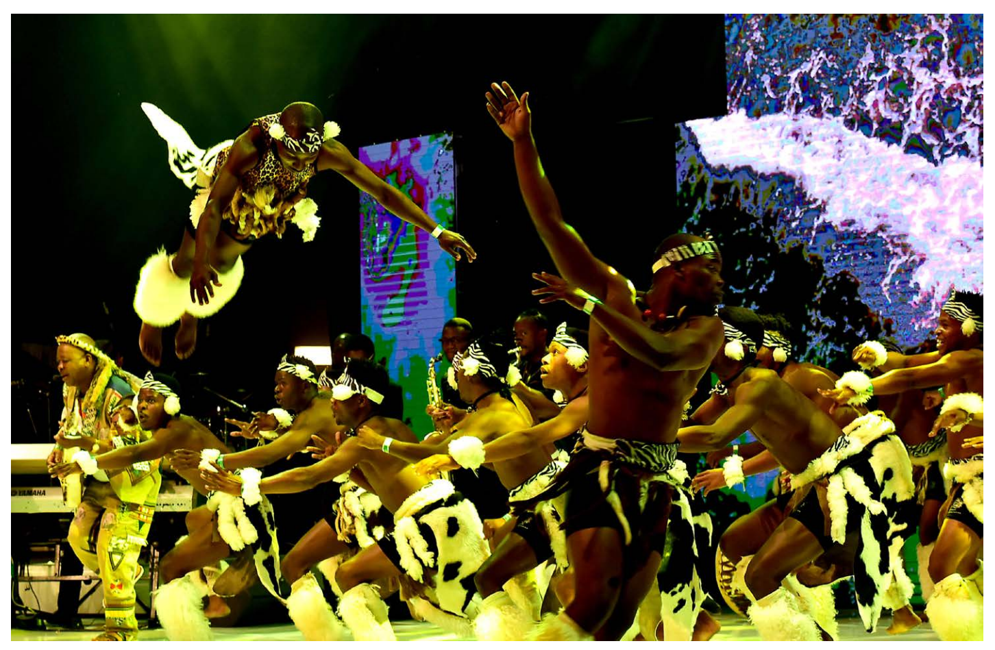
A cultural performance at the 10th BRICS Summit.

together against all nationalist sentiments growing all over Europe [10].