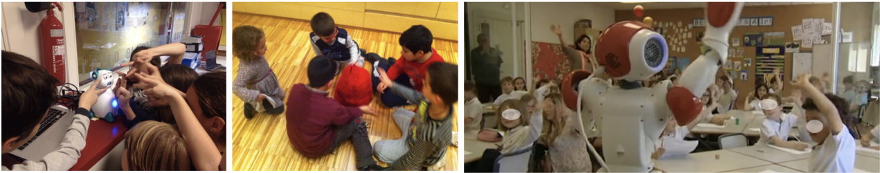
Figure 1: From left to right, a) the robot can have the function of social agent, b) robot as a playful tool, and c) robot as a coach.