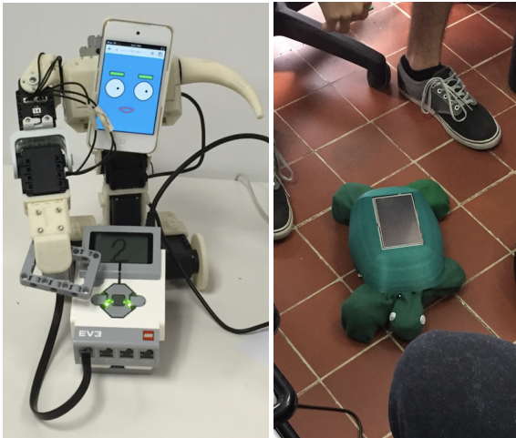
Figure 2: Different robots built in-house for cognitive therapies, including TBI and autism.

and after the injury, however, TBI sufferers encounter the need to develop and the acquire new cognitive functions, which is crucial in young populations [17].