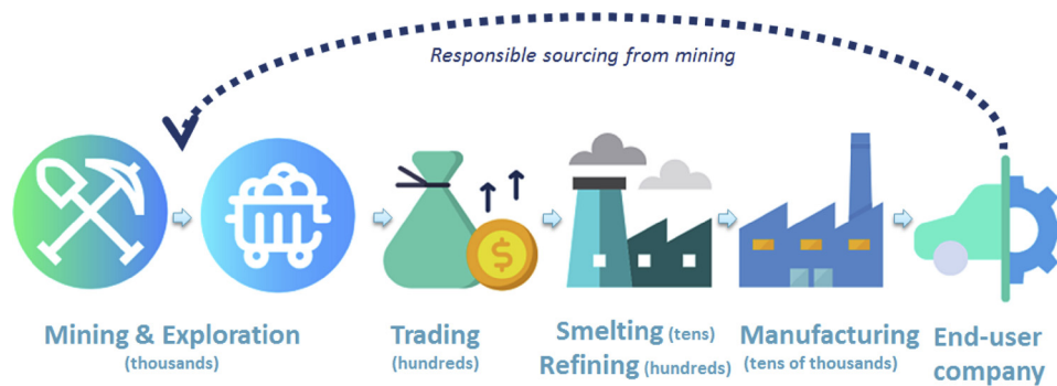
Fig. 1. Responsible sourcing by the end-user company from mining. Icons are from FlatIcon (2019), numbers of companies in the supply chain from Philips (2019).