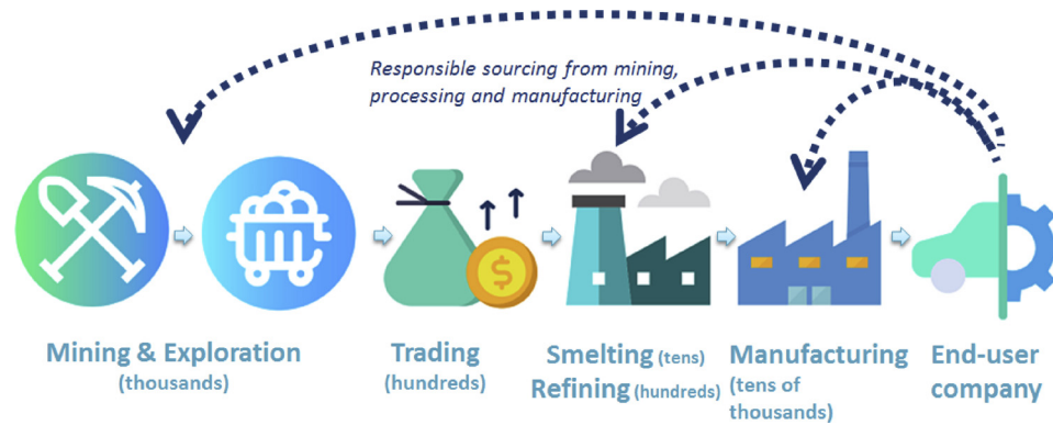
Fig. 2. Responsible sourcing by the end-user company from mining, processing and manufacturing. Icons are from FlatIcon (2019), numbers of companies in the supply chain from Philips (2019).

but it is noted that supplements on other minerals may be added to the guidance in the future (OECD, 2016). At the latest OECD Forum on Responsible Mineral Supply Chains, there were discussions on adding cobalt and mica (OECD, 2018).