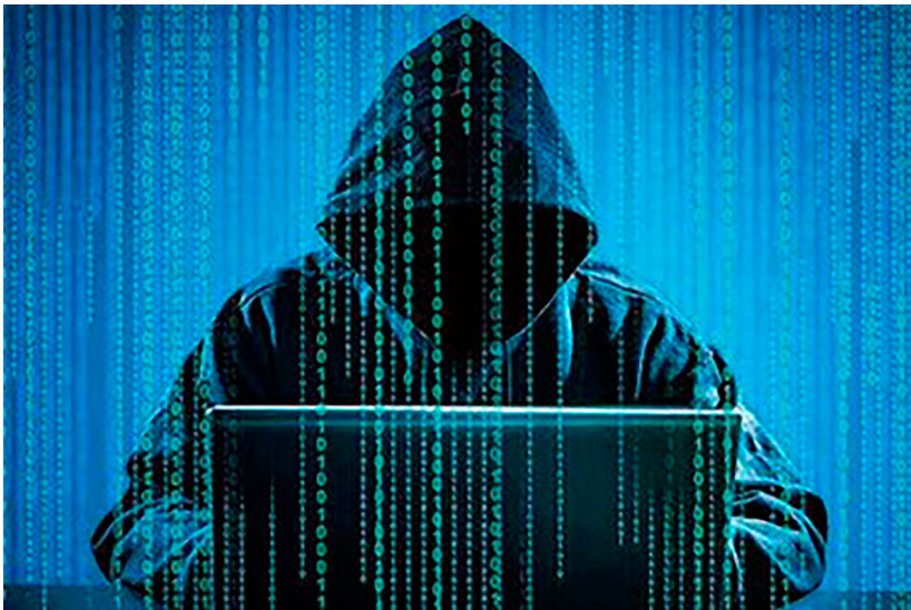
Figure 1. Hacker stock photo.

The black hat becomes a black hood in the most recognizable noir-influenced cybersecurity visualization, the paradigmatic “hacker” image (Figure 1, overlaid with green code). The hacker stock photo reportedly first appeared in 2008 (Know Your Meme, 2016), and images similar to Figure 1 accompany many cybersecurity texts. Such images often include a hood, dark face, balaclava, leather gloves, and keyboard, and clearly borrow significantly from the noir visual style and palette. The discursive power of these images in shaping expert cybersecurity discourses has been noted by IR scholars (Unver, 2017), and they are seen as so detrimental to a “proper” representation of cybersecurity that influential funding bodies have commissioned projects to find a replacement (Sugarman & Wickline, 2019).