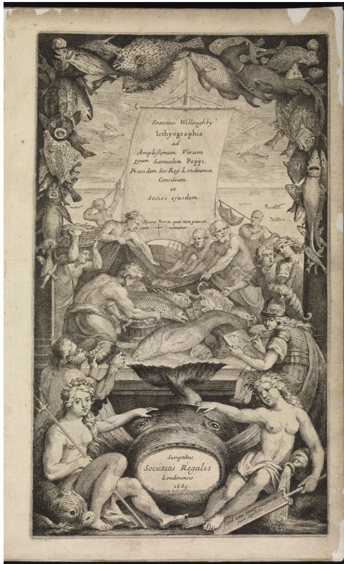
Figure 1. Paul van Somer II, title page of Ichthyographia (1685).

creature, a female figure reposes on a jug from which water is pouring, adding to the sense of flow and movement of the scene. All in all, the title page evokes a sense of exuberance and abundance. Considering that frontispieces of early modern works of natural history and philosophy often present a visual programme of a book's contents, 12 this one brings together various sources for knowledge about fish: classical accounts, illustration and first-hand observation.