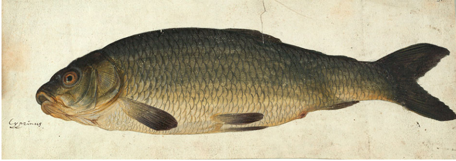
Figure 3. Watercolour of a species of carp, inscribed 'Cyprinus' in Willughby's hand. (Online version in colour.)

The authors looked to Baldner's manuscript for a wider range of observations. 147 They copied, for example, some of his statements on whether a certain species was rare or common in his area, how its appearance could vary with time or place, when and how it procreated, and when it was best to eat. 148 To focus on only those parts of the manuscript included in the Historia piscium , however, is to miss out on many other fascinating observations. These include Baldner's account of having caught a sturgeon of 'about the thickness of a man', and subsequently finding its bowels to weigh 130 pounds. 149 Thus, like Willughby, Ray and their peers, Baldner dissected fish and studied their internal anatomy; he even counted the thousands of eggs in the roe of pikes and turbot. 150 He noticed that the species of wood trout took on the colours of their environment: they turned completely white when placed in a white tub, and black once put in a black tub. 151 He disagreed with Gessner that carp were (sometimes) born from mud, and said that they all came from roe. 152 All in all, Baldner's manuscript demonstrates that he aimed to distinguish species from one another, to examine their anatomies and to understand how they behaved and procreated, and that he held his own observations against those described by earlier authors—again, much like Willughby and Ray.