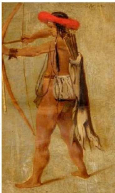
Fig. 3. Tapuyarum alius venatur aut miles. Attributed to Albert Echkhout, c. 1640. Gouache and/or oil-on-paper. Liber picturatus A 34, The Jagiellonian Library Kraków, Special Collection Department, reproduced with permission.