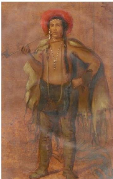
Fig. 2. Tapuyarum quidam. (Marg. in H. B., p. 270). Attributed to Albert Echkhout, c. 1640. Gouache and/or oil-on- paper. Liber picturatus A 34, The Jagiellonian Library Kraków, Special Collection Department, reproduced with permission.