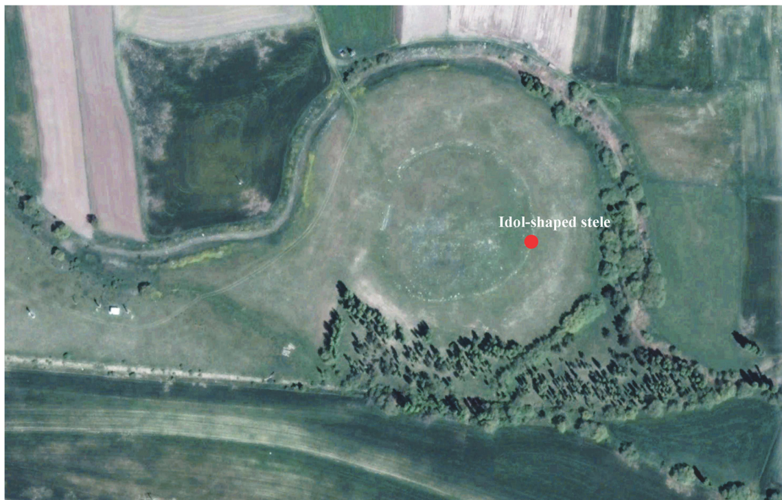
Fig. 3) Find location of the idol shaped stele