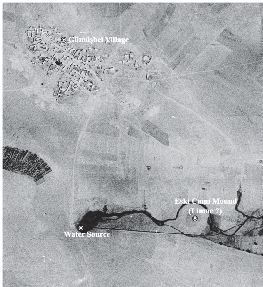
Fig. 2) Aerial Photo of 1954