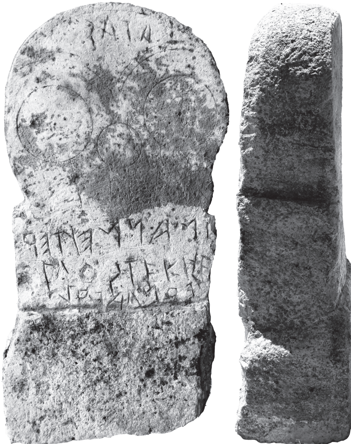
Fig. 4) Photo of the idol-shaped stele (R.Tamsü Polat-Y. Polat)