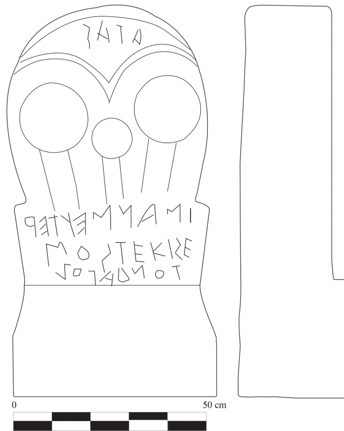
Fig. 5) Drawing of the idol-shaped stele (R.Tamsü Polat-Y. Polat)