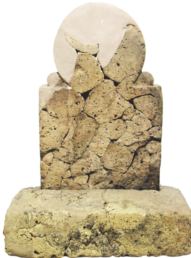
Fig. 6) Semi-ionic stele / idol at the Cappadocia Gate. It was placed at the Yozgat Museum in 2010