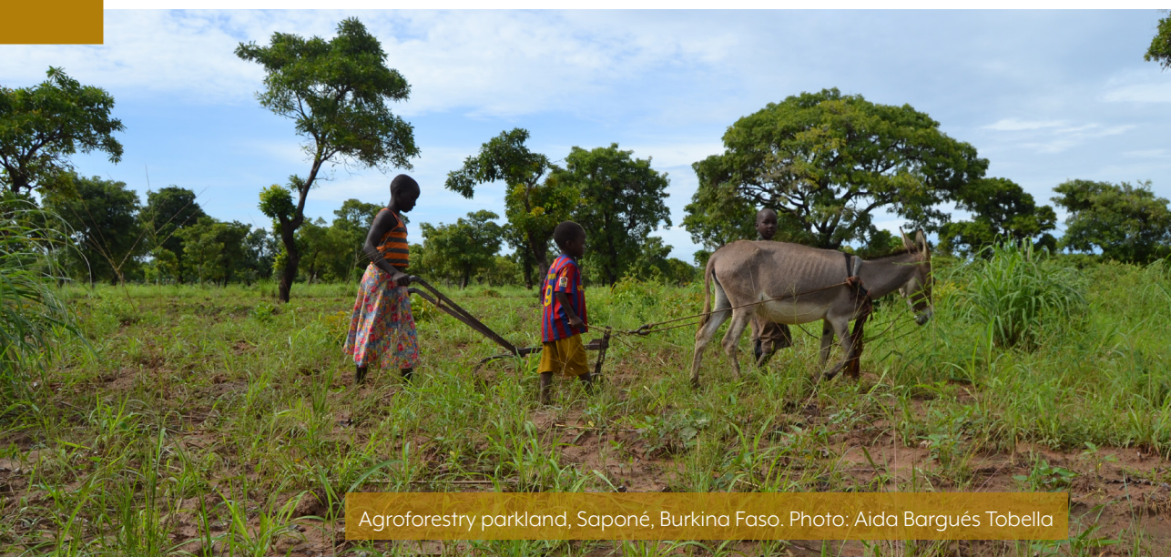
Agroforestry parkland, Saponé, Burkina Faso.