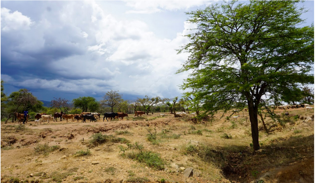
Livestock grazing in the rangelands of Chepareria, West Pokot, Kenya.

greater tree cover can improve recharge over vast regions, especially where land degradation has impaired infiltration (Ilstedt et al. 2016).