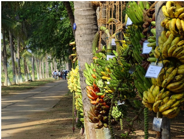
FIGURE 1 Diversity of banana bunches at a germplasm collection exhibited at the National Research Centre for Banana (NRCB) in Trichy, India (with genebank curators at the back).

In this study, we present an approach used to generate, store and disseminate a catalog of genetic variants of banana and plantain