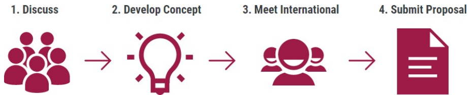
Image 2: Stages of collaborative online learning at WSU, Figure from Go Global