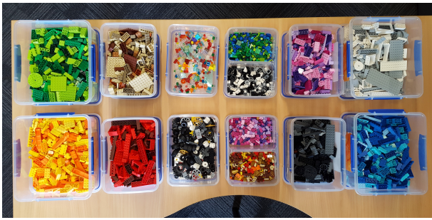
Fig. 1. Boxes of bricks organized by colour and size.