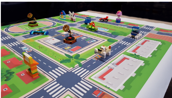
Fig. 4. City plan at the end of the activity

17) They reflect on the activity and share their experience. Some questions to promote participation are: