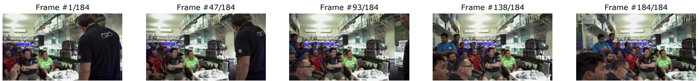
a man talks to a group of people in a classroom