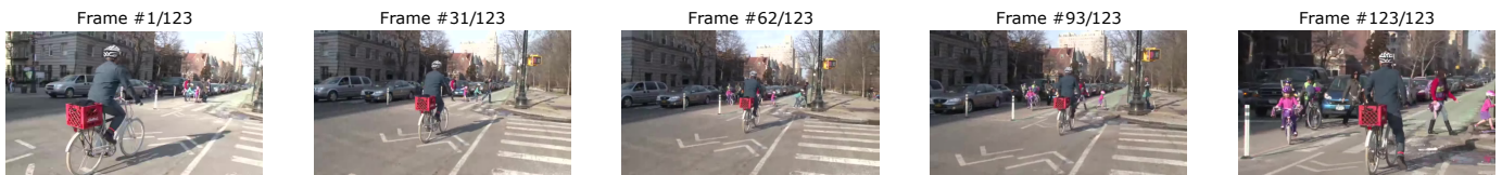
A man in a parking lot of snow moves on a street in the daytime.