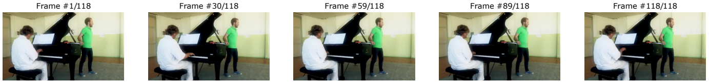
A young man playing a keyboard and singing.