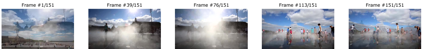
A group of people are dancing on a beach.