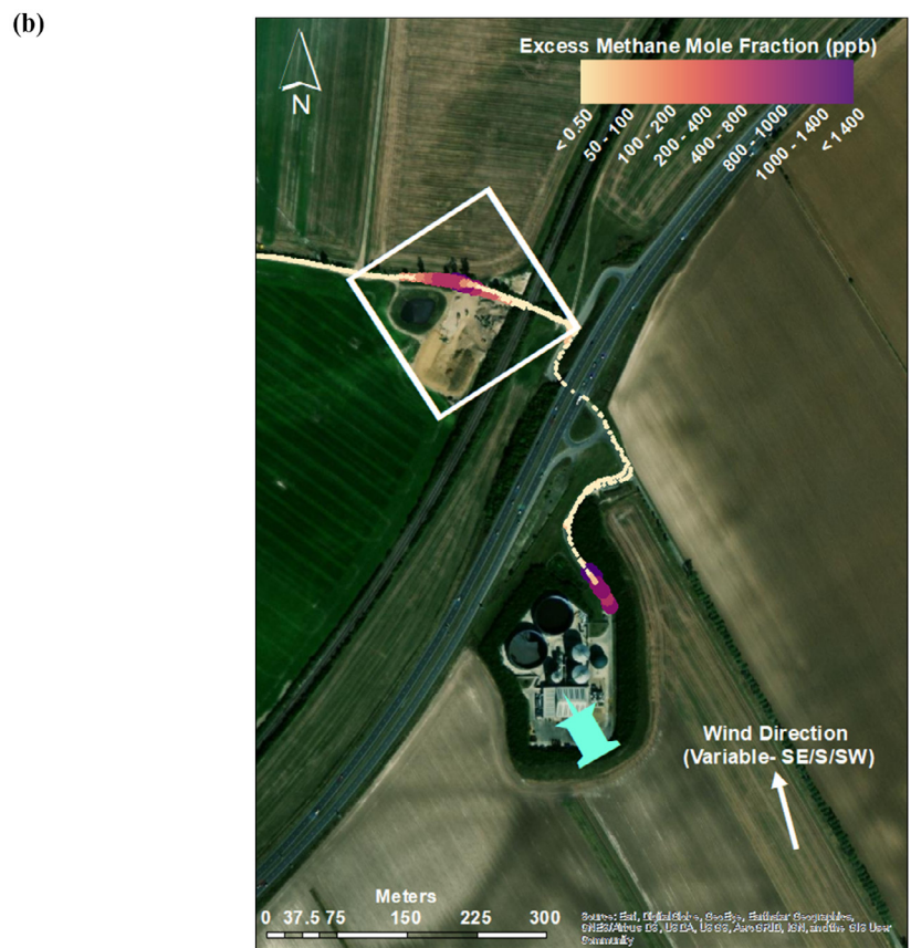
Fig. 1. a) Downwind plumes of biogas plant A sampled during a 1-hour period of a mobile survey on 30 January 2020. (b) ArcGIS map of excess CH 4 mole fraction above background in ppb, as a top view of downwind plumes of plant A. White arrows show the wind direction. White box represents the data used in emission rate calculation. Green pin indicates the site of biogas plant A. The surveyed road was reached after passing under the highway. (For interpretation of the references to colour in this figure legend, the reader is referred to the web version of this article.)