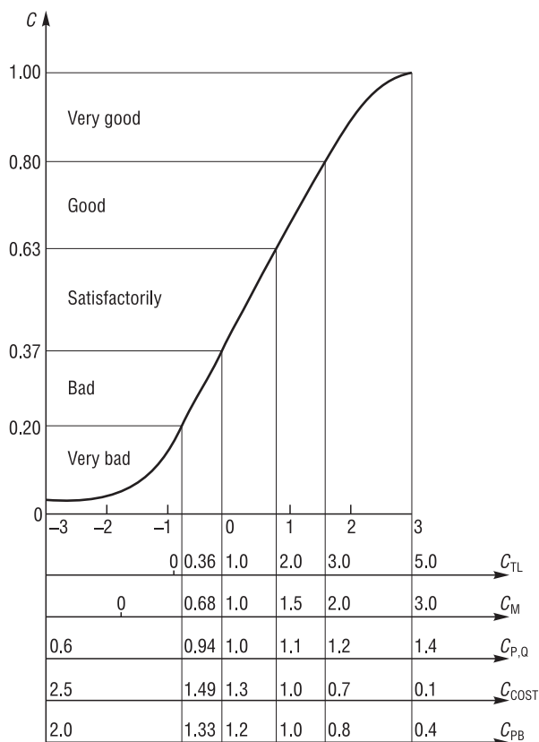
Figure 2. Generalized desirability function of efficiency coefficient set of the tool use in production

where C_i – the dimensionless value of a parameter or criterion, given in accordance with the de-