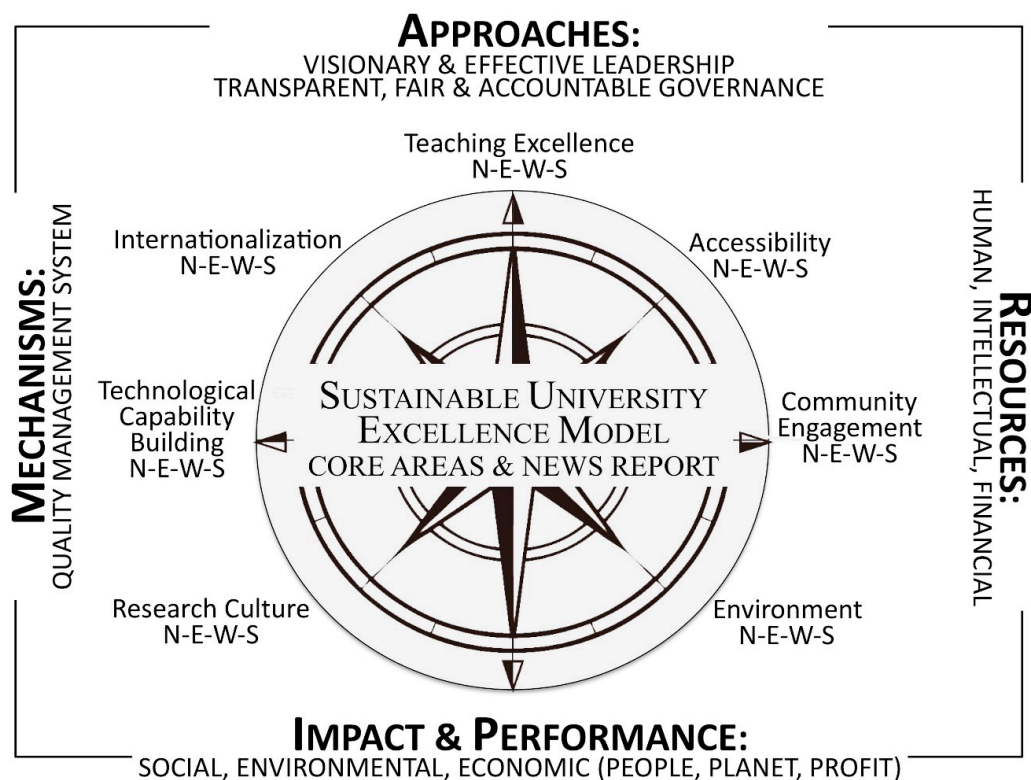
Figure 1. Sustainable University Excellence Model.

The selection of the symbols N-E-W-S is highly intentional in that these connote to the four primary directions on a compass (North, East, West and South) that when arranged in the stated order spell the word news . As such, springboard assessment associated with the SUEM is intended to provide insight into current performance—e.g., “news”—and foresight into where to move next and how to do so, that is, a compass (N-E-W-S) [128].