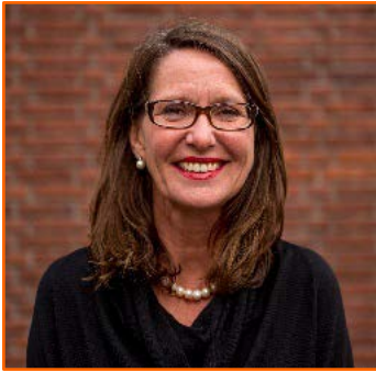
© Central Institute of Mental Health