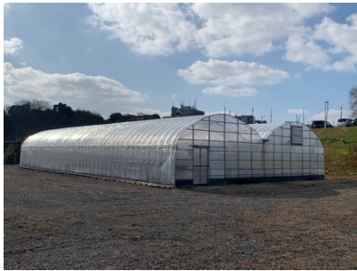
(a) Overview of the house

area is designed for cultivation with soil and the other is for hydroponics.