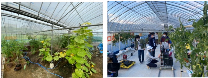
(b) Inside the house