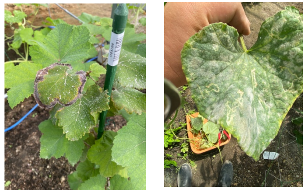
(b) Disease detection