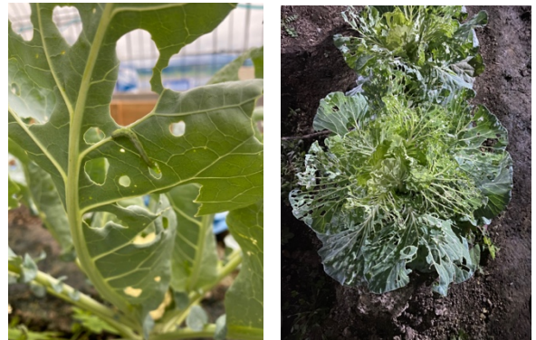
(a) green worms imitating the leaf vein

Using the experimental house, we will encounter to various problems in agriculture. For example, recognition of green worms imitating the leaf vein, disease of plants, harvesting and so on. Transmitting data to cloud data base is also one research topics with limited communication like Sigfox, Lora, etc. The detail of exercise for Agricultural IoT course is presented in the paper [5] in this conference. Also the Tomato-Harvesting-Robot Competition was held in the greenhouse from 7th competition in 2020 [6].