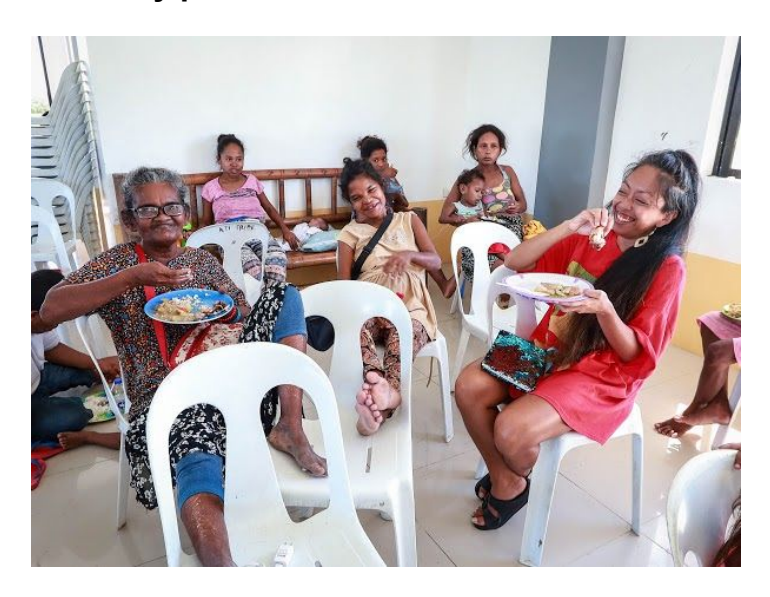
(Figure VI. Photo by Ramon Gonzales III, Author's field research with the Ati community, December 2019)

I am from Panay Island, which makes me a Panayanon . I am from the city of Iloilo, which makes me Ilongga . I speak the language, Hiligaynon , a language spoken in the Visayas that is also linked to the Austronesian diaspora, making me Austronesian . Traces of all these sub races are in my makeup. Thus, this work is my effort to make sense of the complex identities within me, maybe that of the Ati, the Malay, or the Austronesian-Melanesian.