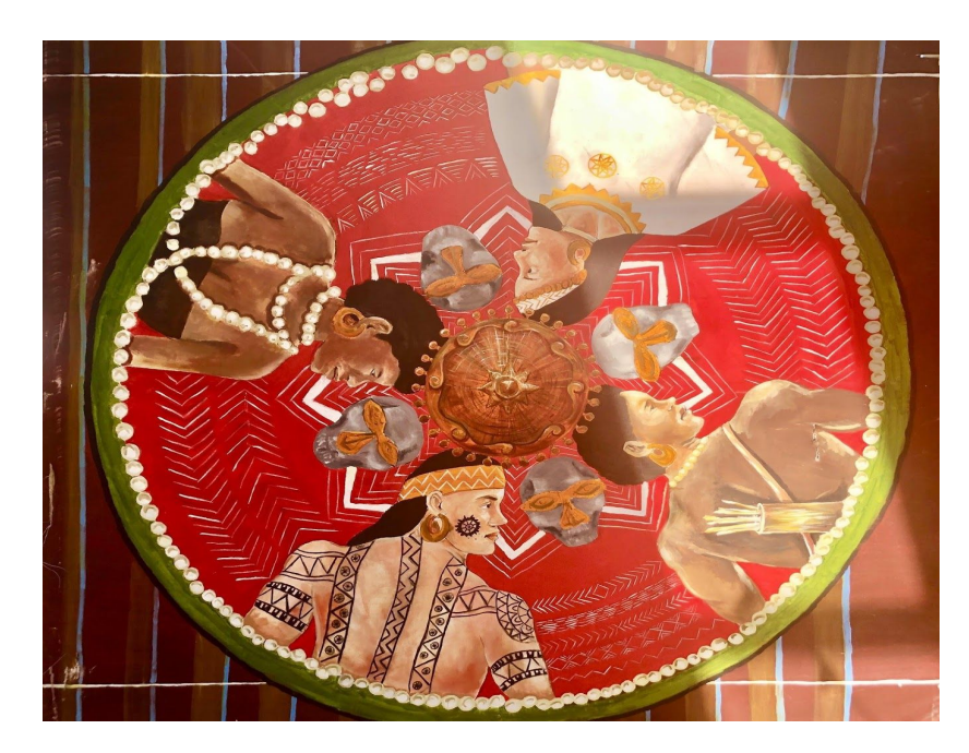
(Figure I. Photograph of a painted mural advertising the Dinagyang Festival in Iloilo City, December 25, 2019)

Categorized as "Negritos" (meaning black ) by the Spanish colonizers, Ati people are the original people of Panay Island, an island located in the central part of the Philippines. Panay island consists of four provinces: Aklan and Capiz on the North, Antique on the West and Iloilo on the Southeast. Depending on what part of the Philippines, the Negrito people are called different names such as the Agta, Ayta, Ita, Ata, Aeta, Batak and Ati. All these names are said to mean "man". <sup>1</sup> The Negritos are the first settlers in the scattered islands we now call the Philippines. Because they lived