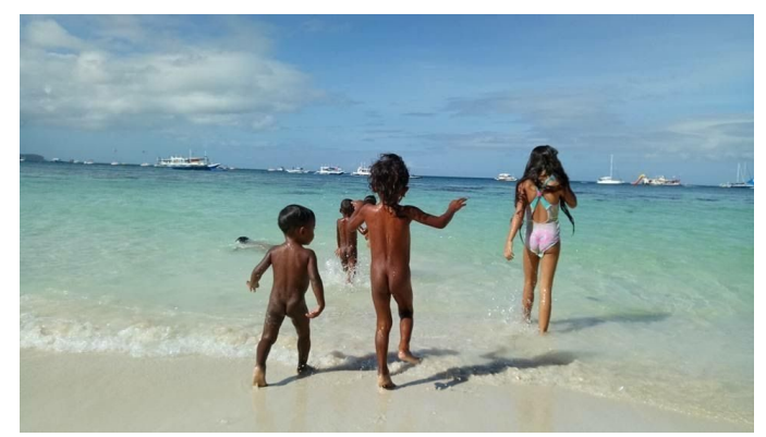
(Figure VIII. My daughter playing with the indigenous Ati children of Boracay, December 2017)