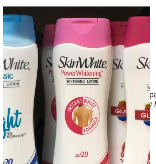
(Figure XII. Skin Whitening product sold in grocery stores. October 2019.)

Just like the rest of the world, including Europe in the 20th century, fair skin is associated with wealth and elite class. White aesthetics are seen as ideal, and the presence of skin whitening products and clinics became abundant. The european look was not the only deemed ideal. A new shift on beauty standards points towards the racially ambiguous "mestizo" (mixed race) as attractive. Darker skin and indigenous features are still associated with labor and lower economic status. Advertisements also contribute greatly to this colonial mindset. Whitening ads are blatantly displayed on billboards, magazines and TV commercials and products are openly sold in grocery and department stores nationwide. <sup>38</sup>