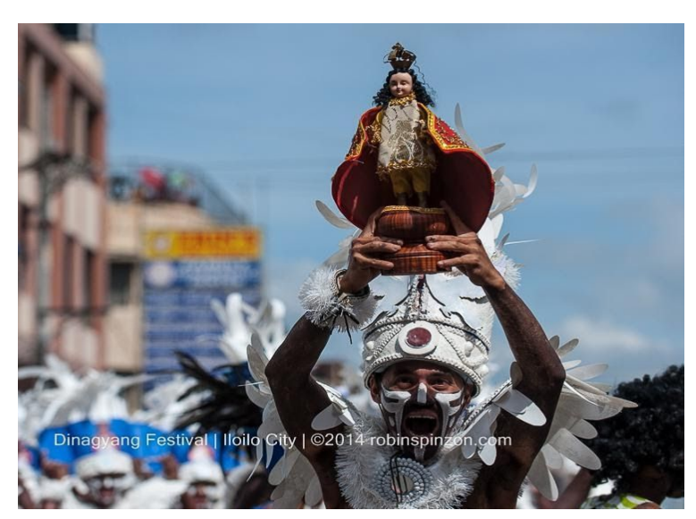
( Figure II: Robins Pinzon, This image shows a Dinagyang dancer raising the Spanish effigy of Jesus, the Santo Nino, 2014, https://robinspinzon.com/tag/dinagyang/ Image from Robins Pinzon)

This new wave of migrants were coined as "Malay" people, a borrowed term used by the Spanish to describe those who are not Negritos but have origins from the Indonesian/Bornean settlers. These so-called Malay people are described as having lighter complexion than the Ati, a bit taller with straight hair. The mytho-historical story recounts Malay people offering a golden salakot (a large brim hat), gold necklace, trinkets and some bolts of cloth to Datu Marikudo and Maniwantiwan . The Ati king and queen accepted the gifts in exchange for Panay's lowlands. As a result, the Atis migrated to the mountains which they hold sacred. To this very day, the Ati refer to the Malay people as the lowlanders.