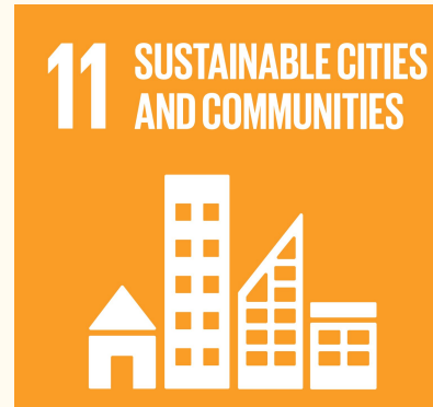
“Goal 11 | Department of Economic and Social Affairs.” United Nations , United Nations, 2020, sdgs.un.org/goals/goal11 .