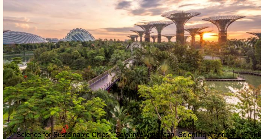
“Science for Sustainable Cities.” Scientific American , Scientific American , 17 July 2018, www.scientificamerican.com/report/science-for-sustainable-cities1/ .