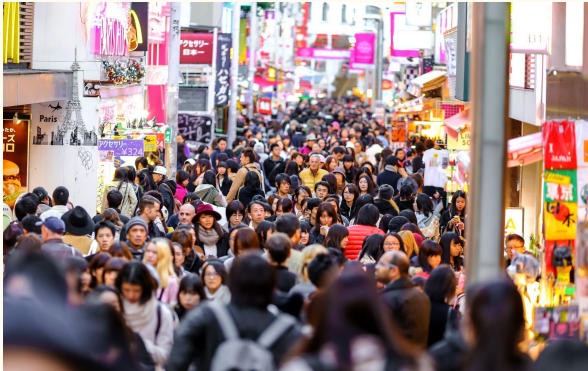
“Cities – United Nations Sustainable Development.” United Nations , United Nations, 2020, www.un.org/sustainabledevelopment/cities/ .