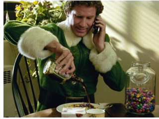
Photo via dailycal.org. (https://mainecampus.com/2020/12/national-holidays-dec-14-through-dec-18/)

ZILLMAN ART MUSEUM HOSTS "CREATIVE CONVERSATIONS-A-QA-WITH-ARTIST-JOANNE-CARSON/) (HTTPS://MAINECAMPUS.COM/2020/12/ZILLMAN-ART-MUSEUM-HOSTS-CREATIVE-CONVERSATIONS-A-QA-WITH-ARTIST-JOANNE-CARSON/)