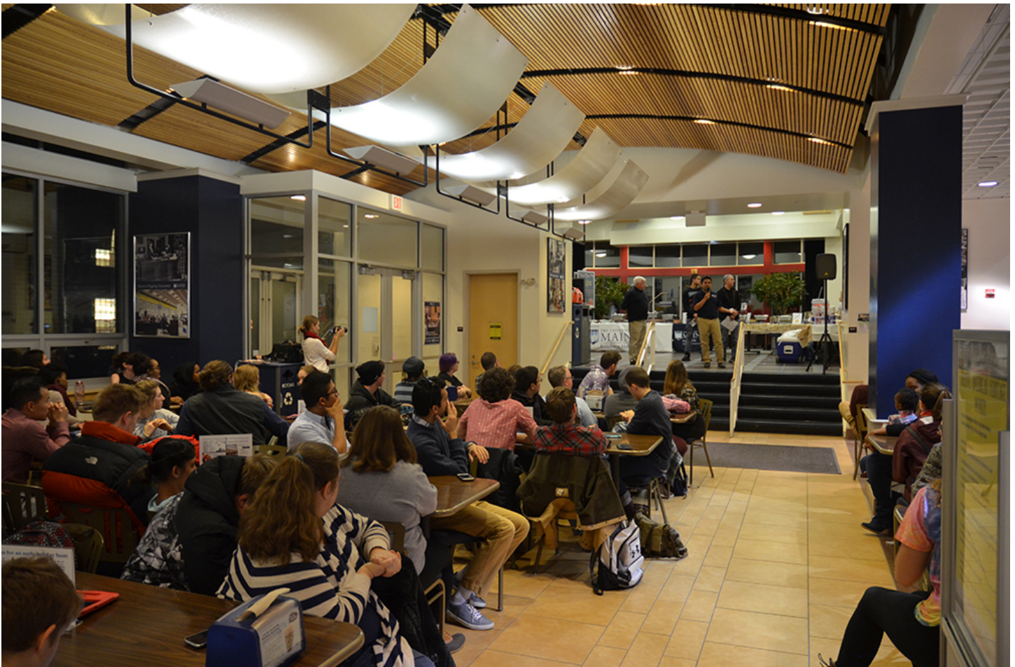
Students and staff from various multicultural organizations join together for an early Thanksgiving celebration on Nov. 9 in the North Pod of the Memorial Union.

Home (https://mainecampus.com) / Culture (https://mainecampus.com/category/culture/) / Campus & Community (https://mainecampus.com/category/culture/campus-community/) / Celebrating diversity through a Multicultural Thanksgiving