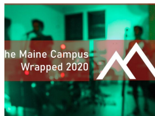
Graphic by Antyna Gould. ( https://mainecampus.com/2020/12/spotify-wrapped-2020-the-maine-campus-top-tracks/ )