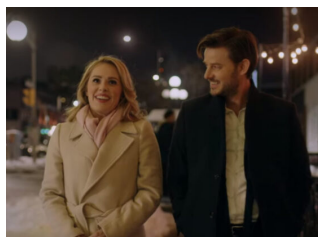
Photo via pluggedin.com. ( https://mainecampus.com/2020/12/radio-show-hosts-find-unexpected-love-in-warm-holiday-film/ )