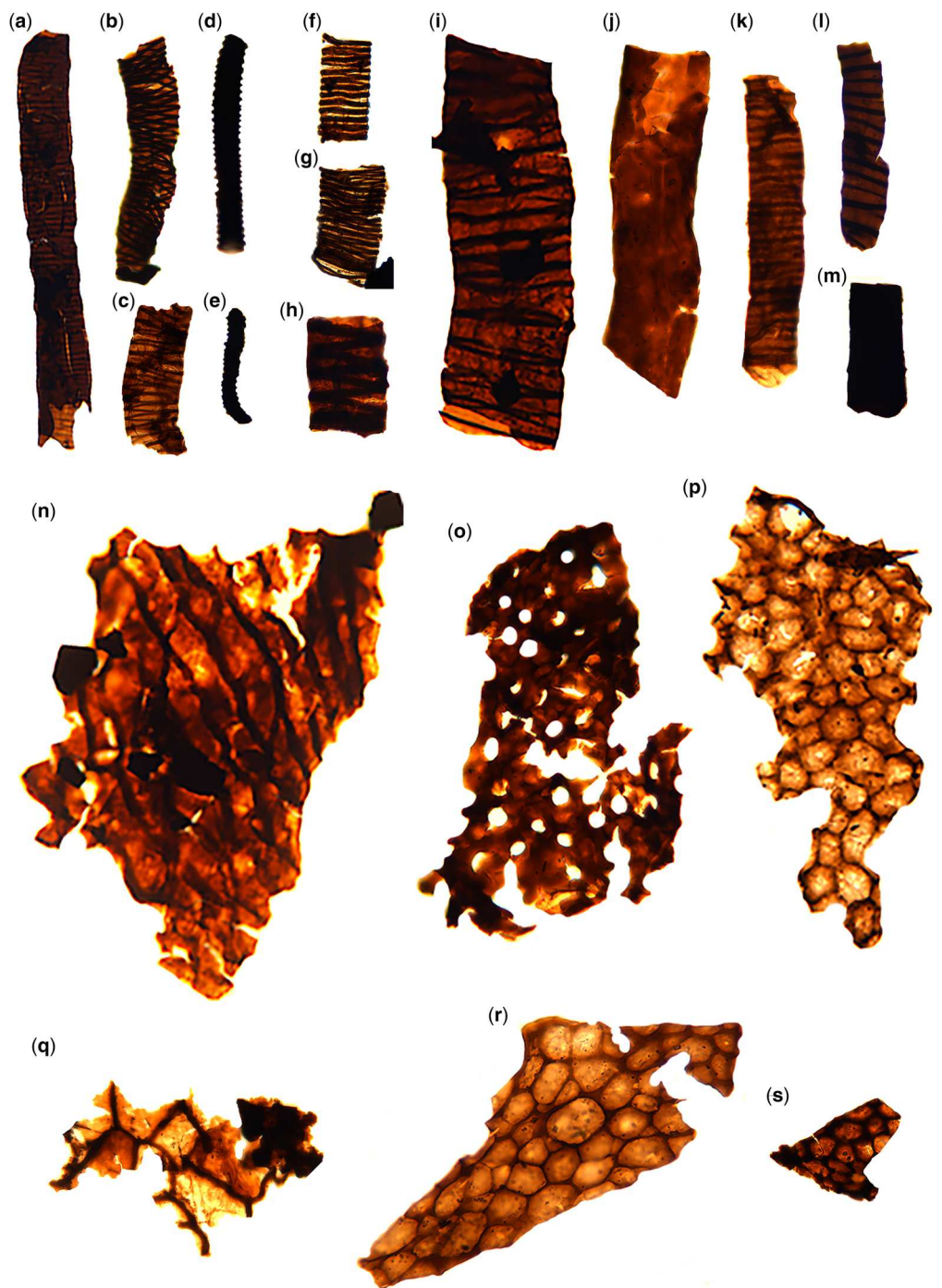
Fig. 2. Phytodebris recovered from Late Silurian–Early Devonian ‘Lower Old Red Sandstone’ sediments from the Ross-Spur M50 motorway succession of the Anglo-Welsh Basin (for details see Edwards 1986 ). Scale bar (top right-hand corner) is 75 \mu\text{m} . (a) Banded tube. Freshwater West Formation, Sample 19M5001.1, Specimen (M22). (b) Banded tube. Moor Cliffs Formation, Sample 19M5009.1, Specimen (U30/2). (c) Constrictitubulus . Freshwater West Formation, Sample 19M5001.3, Specimen (G36/2). (d) Banded tube. Freshwater West Formation, Sample