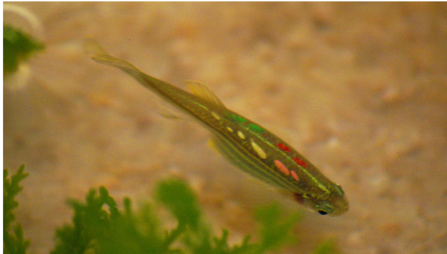
Figure 3. A VIE-tagged individual with fragmented elastomer under the skin. Visible are four coloured marks (as tagged 4 position).

almost 100% (only one fish lost a tag in a 6 months period), occasional tag fragmentation occurred over time, but individual fish remained easily identifiable (Table 2; Figure 3).