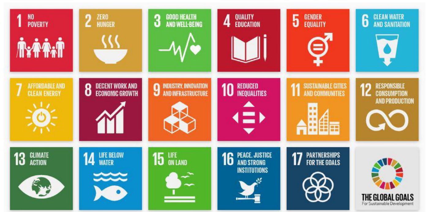
Fig. A. 17 Sustainable Development Goals.

(SDGs website: https://www.un.org/sustainabledevelopment/sustainable-development-goals/ )