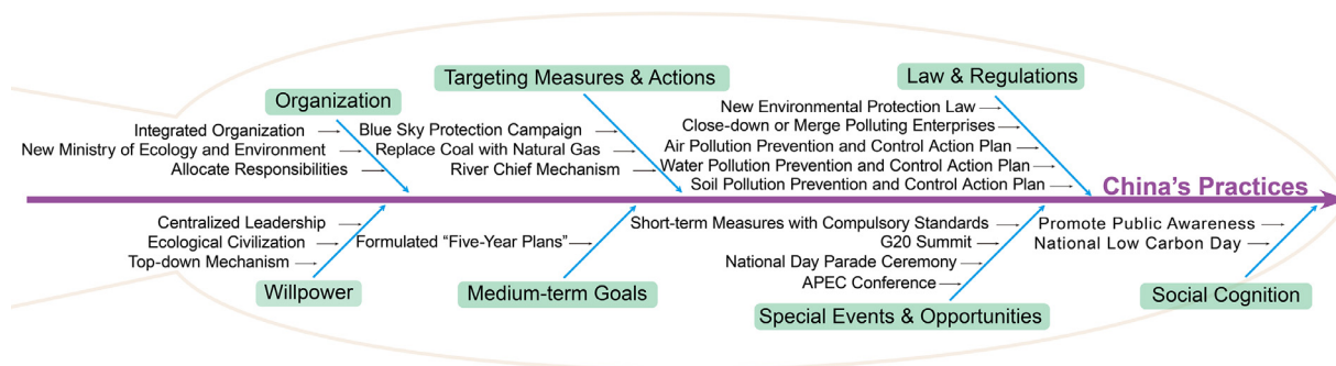
Fig. 1. China's practices in combatting climate change and achieving Sustainable Development Goals.

efforts, the top-down strategy for climate mitigation has benefited multiple Sustainable Development Goals (SDGs). First, China's carbon emission, compared to the 2005 level, decreased by 48% in 2019. This figure is larger than the 45% goal by 2020 (NBS, 2020) (SDG 13). Partly contributed to this success are eight regional pilot emission trading systems (ETS) that have been launched since 2013. Second, the conservation of natural resources has surpassed the goal of 1.3 billion cubic meters by 2020 as the volume of China's forest stock increased by 3.8 billion cubic meters in 2019 (MEE, 2020b) (SDG15). Third, the non-fossil-fuel power accounted for 14.3% of the country's total primary energy consumption, closing in the target of 15% by 2020 (UNFCCC, 2018). China also significantly reduced the cost of renewable energy (Yan et al., 2019) (SDG 7) and improved air quality level. In 2019, 46.6% of 338 cities at or above prefecture level in China met national air quality standard (including pollutants assessment of SO 2 , NO 2 , PM 10 , PM 2.5 , CO and O 3 ). This number is 25% greater than that of 2015 (MEE, 2020b). Finally, China's life expectancy surpassed 76.7 years according to the World Population Review in 2019 (SDG 3) (World Population Review, 2019). In the same year, the State Council of China further released the Healthy China 2030 Actions, aiming to further improve the overall environmental and health conditions (The State Council, 2019; Zhang and Gong, 2019).