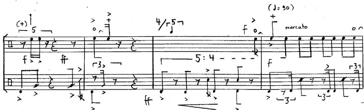
Figure 2 – Example of rhythmic notation in Study III (Nemtsov, 2011, p. 6)

Nemtsov (2011) specifies that although the more strictly rhythmically notated sections do not have time signatures indicated, the rhythms should be precisely adhered to, in a clear contrast to the free, spatially-notated sections. Although metre is seldom indicated, Nemtsov often provides a metronome mark for these rhythmical sections, such as in figure 2 – the last bar in this extract introduces a funk-shuffle groove that continues to the end of the piece.