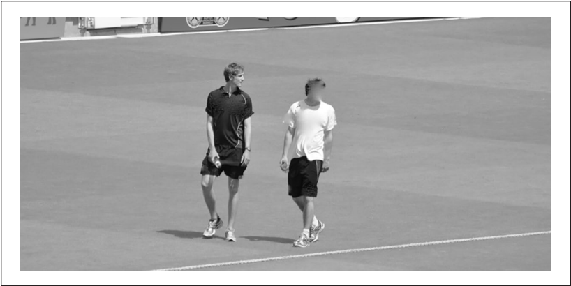
Figure 3. Creating space for one-to-one interaction.

privacy that this ritual afforded both observer and observed that enabled other performances to be engendered in conversation away from the performative pressure and scrutiny of the wider group. According to Turner (1987, 81), (role) performance is a reflexive action through which we come to know ourselves and each other better, crystallizing a process of knowing that is central to the ethnographic endeavor. As an ethnographic encounter, these moments helped to reveal that although “you” (cricketer) and “I” (researcher) are different, we share substance as emerging adults with similar outlooks, ideals, and concerns.