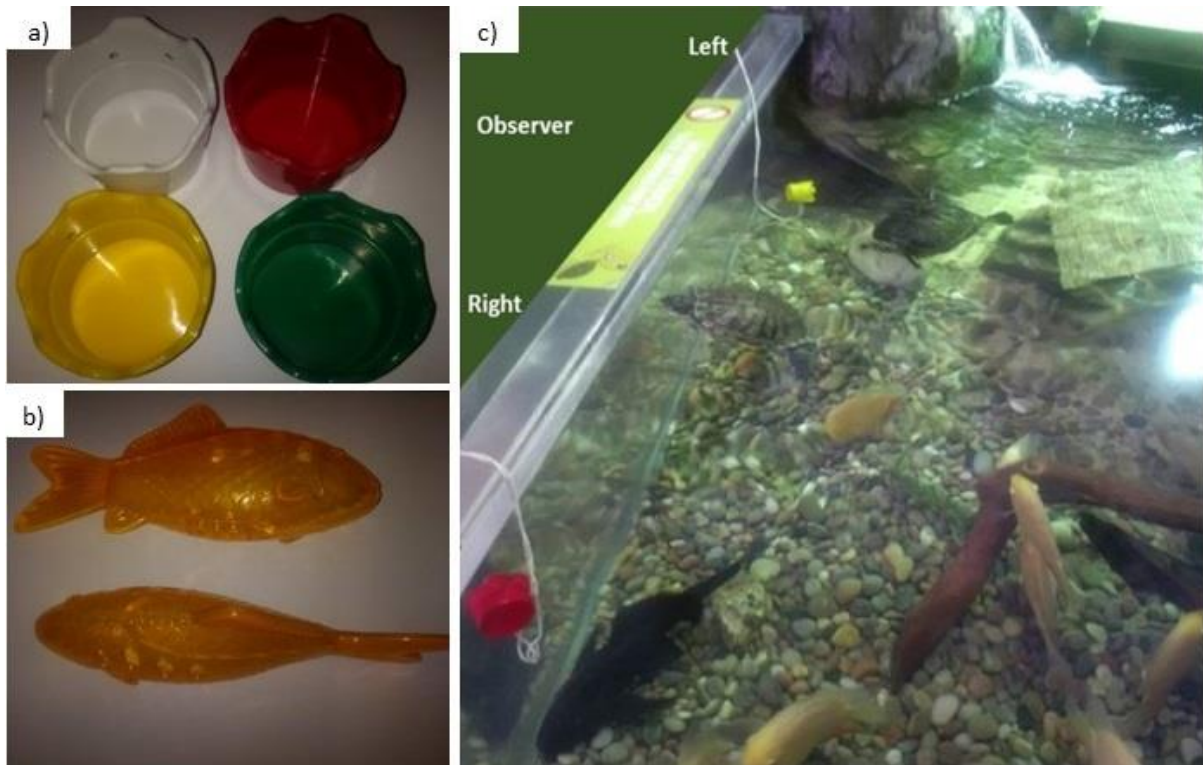
Table 2. Novel colored enrichment object and olfactory cues combinations presented to the turtles at the Tynemouth Aquarium.

Figure 2. Enrichment devices used: a) colored plastic cups (white, red, green and yellow; 65 x 65 x 45 mm; ASDA Stores Ltd. UK), chosen to be of biologically relevant colors, based on body coloration (red, yellow) and food given (green, white); b) yellow fish-shaped turtle feeder (190 x 70 x 40 mm; Zoo Med Laboratories Inc. USA); c) location of colored objects in the turtle pool: left = near the waterfall and the light source; right = near the opposite corner of the enclosure.