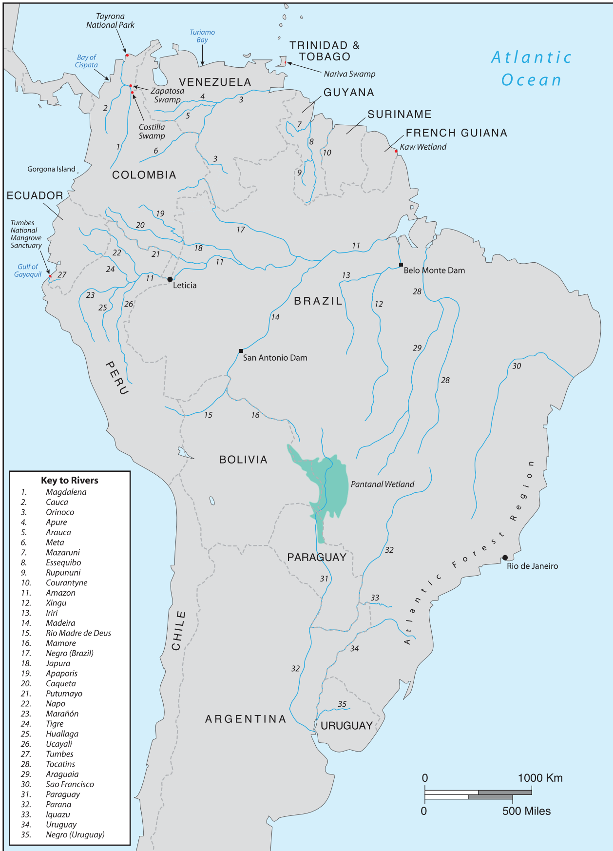
MAP 2 Map of key waterways and places notable for human-crocodilian interactions in South America