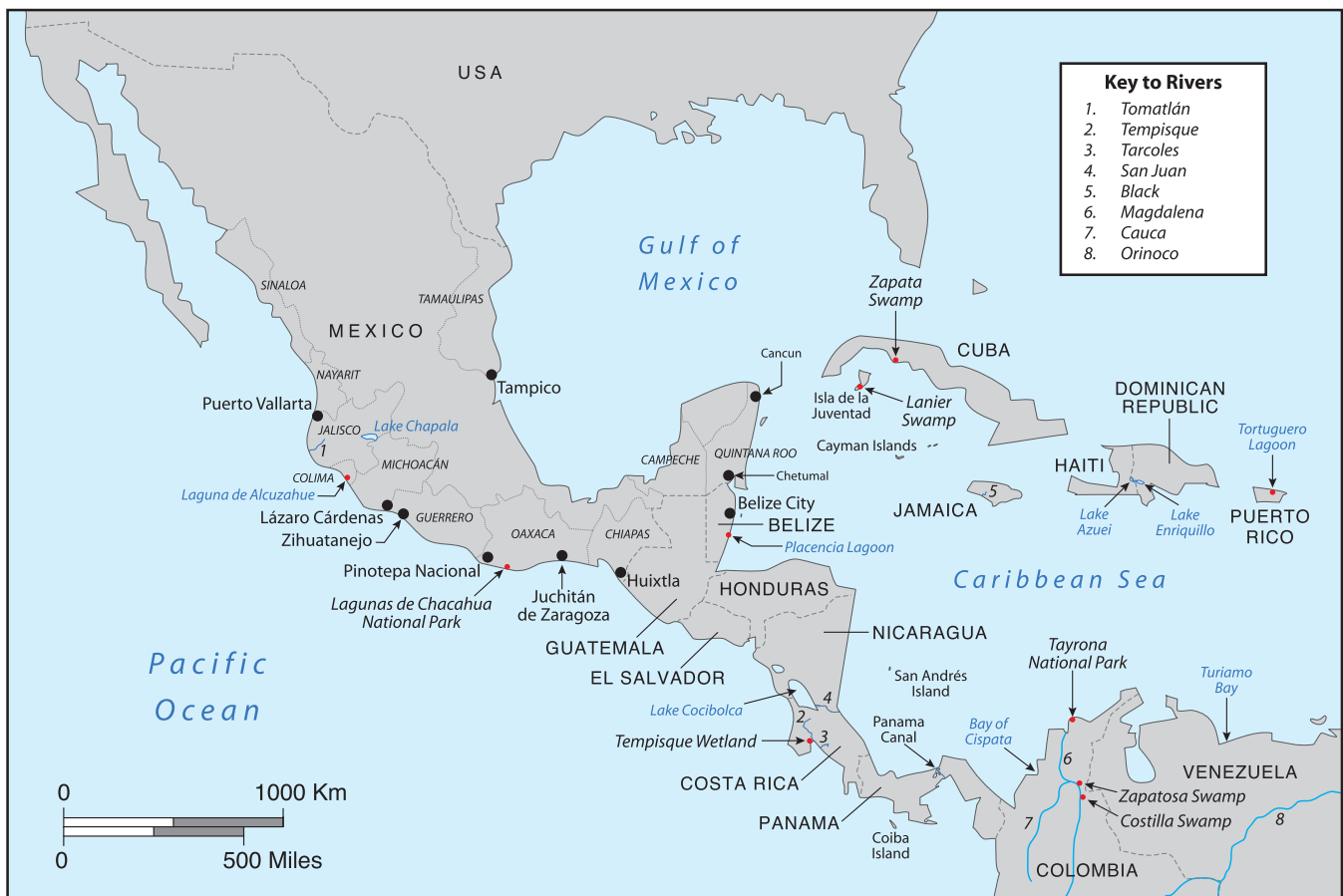
MAP 1 Map of Central America and the Caribbean region including areas with significant crocodilian populations, places and waterbodies noted for human-crocodilian interactions