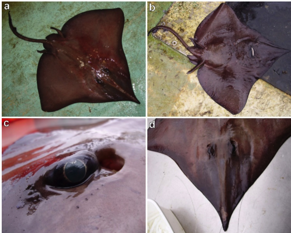
Fig 2. Photos of the two specimens of Dipturus nidarosiensis collected in the southern Adriatic Sea. Photos description as follows: a) dorsal view of specimen 1; b) ventral view of specimen 2; c) closeup of the left eye and spiracle of specimen 2; d) closeup of anterior part with rostrum of specimen 2. See Table 1 for additional details

margins; underside darker brown and covered by a thick black mucus layer. This description is in agreement with that given by EBERT & STEHMANN (2013).