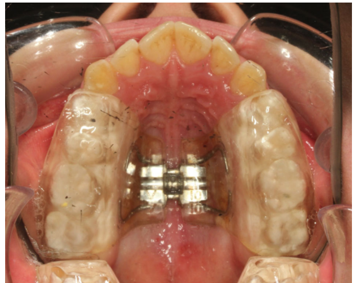
Figure 1. Occlusal view of an acrylic bonded RME appliance.

severe pain and severe palatal mucosal ulceration (Figure 2), and in which the sutural resistance was inspected on occlusal radiographs allocated to the F-RME group. RME patients with 35 - 45 quarter-turns screw activation without any complications and in which the sutural opening was confirmed by occlusal radiographs were included in the S-RME group.