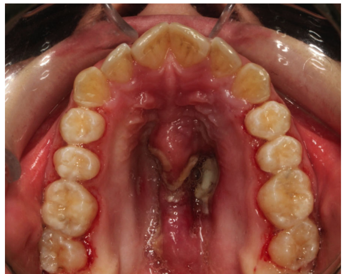
Figure 2. Mucosal ulceration after the activation of the RME screw.

The skeletal maturation of the participants in both groups was examined according to the cervical vertebral maturation (CVM) method 19 using pre-treatment lateral cephalometric radiographs. In the F-RME group, all patients were found to be at the CVM stages 5 and 6. Consequently, to standardize the groups, patients who were not at CVM stages 5 and 6 were excluded from the S-RME group. Finally, the records of 11 patients (10 females,