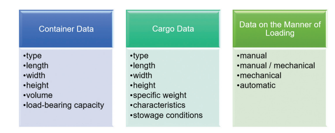
Figure 1. Input parameters for developing the basic algorithm.

In this chapter, the input parameters that determine the set-up of the basic algorithm will be defined. As the process of handling the loading of the container consists of three reciprocally