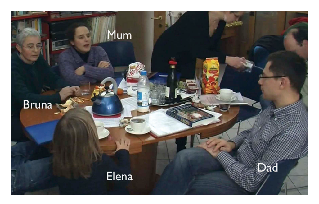
Figure 1. Frame from line 7, Extract 4, as Mum is saying 'Elena'.

Mum's factual declarative voices Elena's protest, which she has not been able to fully express. Dad's response to the description is extended and complex. So let us focus on the nonverbal stream of his behavior first; we will come back to the verbal stream later.