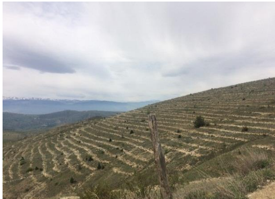
Figure 2. General view of study area.

The semi-arid Central Anatolian climate and humid Black Sea climate characteristics are observed in Şebinkarahisar. While the average temperature value was 9.0 C°, the maximum and minimum temperature values were determined to be 39.6 C° and – 23.5 C°, respectively. The average amount of precipitation is 572.2 mm.