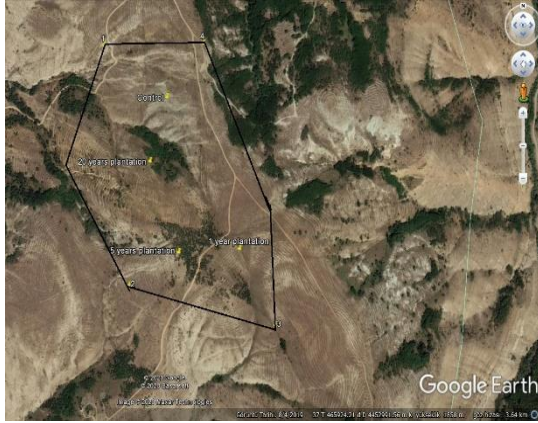
Figure 1. Location of the research area in Turkey

The semi-arid Central Anatolian climate and humid Black Sea climate characteristics are observed in Şebinkarahisar. While the average temperature value was 9.0 C°, the maximum and minimum temperature values were determined to be 39.6 C° and – 23.5 C°, respectively. The average amount of precipitation is 572.2 mm.