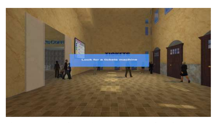
Fig. 2: Example of how the next task to perform is shown to the user.

As can be observed, all the means are lower for the HQR experiment than for the LQR experiment. A further study should be performed with more participants performing the experiments to check if there exists a statistically significant median between the LQR and the HQR groups (a Wilcoxon