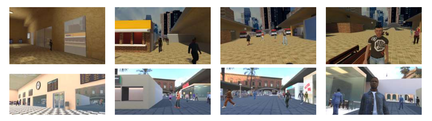
Fig. 1: Images showing at the top row the lower quality rendering (LQR) and at the bottom row the higher quality rendering (HQR) of the crowded train station

effect. Another study explored how photorealistic characters showing emotions would affect the responses of participants ([11]). They performed an experiment in which an avatar rendered with high, medium and low realism interacted with the participants in several situations: showing a sad, friendly and unfriendly attitude. They found that, for some emotions, the participants felt more concern for the high realism style compared to the other two.