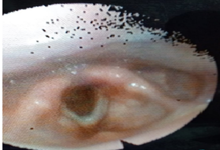
Figure 4. Laryngeal endoscopic control after 4 months of the anti-tubercular treatment. Supraglottic oedema and nodular mucosa had disappeared (screenshot of live laryngoscopy).

cal symptoms (complete clearing of dysphagia, dysphonia and sore throat), and normalization of the biological tests (inflammation and lymphopenia). All lesions were cleared in the otorhinolaryngologic control (Fig. 4), bacilloscopic control of sputum was negative and pulmonary lesions subsided (Fig. 5).