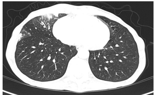
Figure 3. Thoracic computed tomography showing branching condensation surrounded by a frosted glass area and a micronodular infiltrate of the right middle pulmonary lobe.

bifocal laryngeal and pulmonary tuberculosis under Adalimumab. Adalimumab was stopped and Chemotherapy was initiated, including: 2-months of quadruple therapy: rifampicin, isoniazid, pyrazinamide and ethambutol, followed by 7 months of rifampicin and isoniazid bi-therapy.