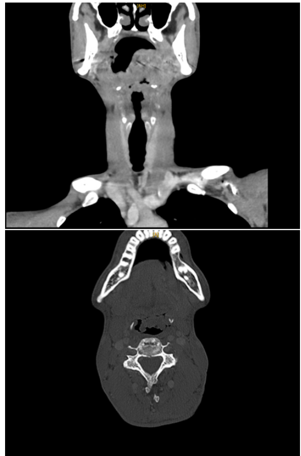
Figure 2. Cervical computed tomography showing diffuse supraglottic laryngeal edema.

The sputum microbiological culture revealed mycobacterium tuberculosis 4 weeks later. Hence, final diagnosis was