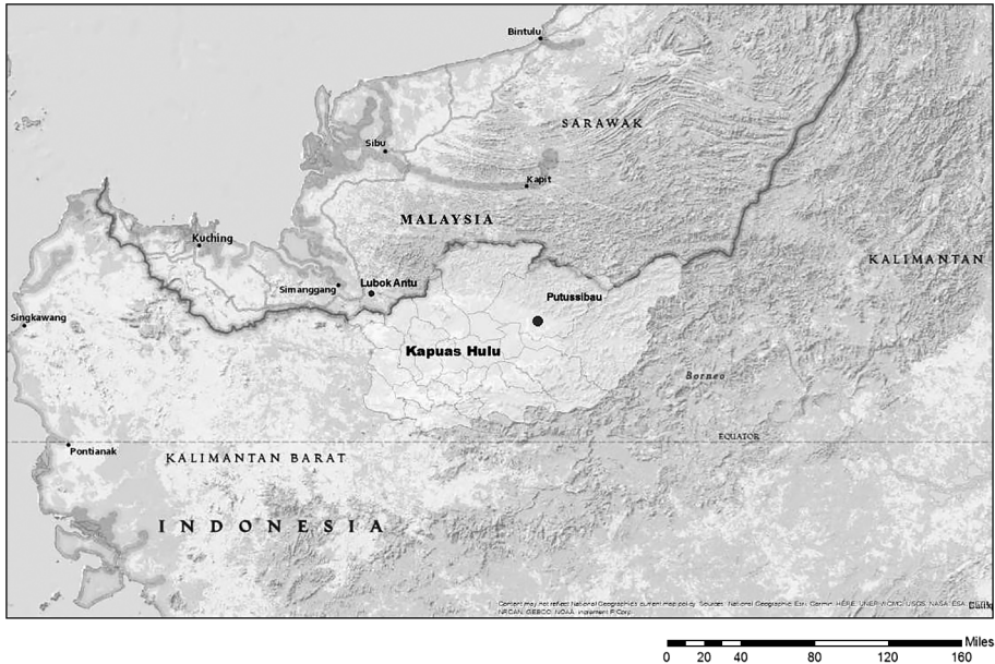
Fig. 1 The Study Site of Kapuas Hulu District in West Kalimantan, Indonesia