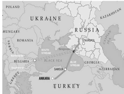
Fig.2 South Stream’s offshore section layout

both global and regional level. Russia is a key factor in the UN Security Council, and due to its historical- geographical stand and cultural links, it is one of the key players in the common European neighborhood policy. Russia is also a major supplier of energy products for the EU market. Russia is a large, dynamic market for EU goods and services, with considerable economic growth. The EU’s market, on the other hand, is by far the most important destination for Russian exports. Companies from the EU are the main investors in Russia. Russia and the EU Member States are all members of the United Nations, the Organization for Security and Cooperation in Europe (OSCE) and the Council of Europe. The ESS predictions came to be accurate, because on June 23, 2007 Gazprom and ENI signed a memorandum of understanding to execute “South Stream” project, which is aimed to strengthening the European energy security. It is another real step toward executing the Gazprom strategy to diversify the Russian natural gas supply routes.