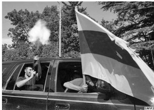
Photo 8. South Ossetia man shoots in the air as he celebrates the recognition of South Ossetia independence by Russia

Two US C17 transport aircraft landed in Tbilisi, from the U.S. airbase in Ramstein in Germany, bringing aid like: children’s cots, sleeping bags, blankets and medical supplies for refugees displaced by the conflict. Air force crew was delivering aid, but distribution was being managed by the United States Agency for International Development (USAID) and the Georgian Health Ministry. Robert Gates, the U.S. Defense Secretary, said that more supplies were expected to arrive in the days ahead by both air and sea. While all this humanitarian aid was ongoing, the Russian president Dmitry Medvedev ordered a cease fire in Georgia on Tuesday, 12 august2008. The agreement came after the heavy talks between the EU presidencies, French President Sarkozy. On August 19, Russia agreed to the stationing of 20 observers from the Organization for Security and Cooperation in Europe (OSCE) to be deployed immediately to an area adjacent to South Ossetia. The talks brought cease fire but the tensions were in maximum, especially after the intensions of Russia to recognize the independence of separated provinces. Following the end of hostilities, the Federation Council of Russia called an extraordinary session for 25 August 2008 to discuss recognition of Abkhazia and South Ossetia. That day later the Federation Council unanimously voted to ask the Russian president to recognize independence of South Ossetia and Abkhazia.