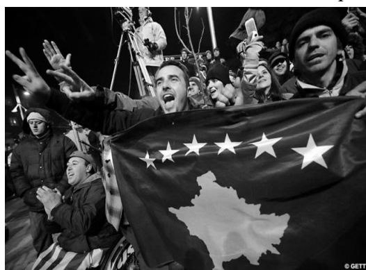
Photo 3. Kosovars celebrating independence with their new flag

In that moment happiness broke up, with tens of thousands of people fledted outside occupying the streets of Kosova's capital, Pristina and celebrating this historical moment. That day the UN Security Council went into emergency session on the evening, after Russia called for the United Nations to declare the Kosova declaration illegal.