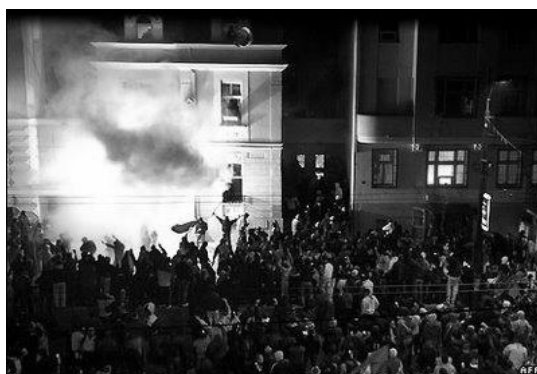
Photo 4. Serbian protestors burning the US embassy in Belgrade

The UN Secretary General Ban Ki-Moon called on all sides to keep op their commitments for peace. Putin immediately charged that, Western support for the newly declared state is immoral and illegal, saying that behavior like this will open “Pandora box” and provoke a global storm of separatism worldwide, and demolition of international order settle by time. As from now Kremlin has no obligation to follow international law when it comes to it. Russian media have publicized a large list of separatist conflicts that could be affected by Kosova events, including Taiwan, the Turkish enclave in northern Cyprus, Spain's Basque region, Quebec, the Kurdish zone in Iraq, Republika Srpska in Bosnia, and Tibet. 71