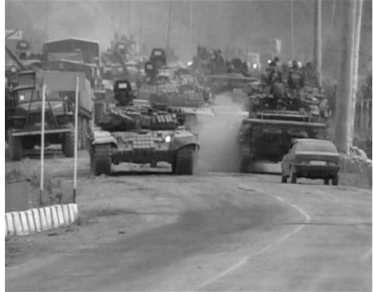
Photo7. Russian military forces occupying South Ossetia

Russia launched the massive attack on the Georgian territory pushing back the Georgian forces from Tskhinvali and starting new war in Caucasia. By the morning of August 10, Russian troops had occupied the bulk of South Ossetia, and reached its border with the rest of Georgia, and were shelling areas across the border. Russian troops occupied several Georgian cities with Russian warships landing troops in Georgia's breakaway Abkhazia region and took up positions off Georgia's Black Sea coast. On August 12, Russian President Dmitriy Medvedev declared that "the aim of Russia's operation for coercing the Georgian side to peace had been achieved the aggressor has been punished